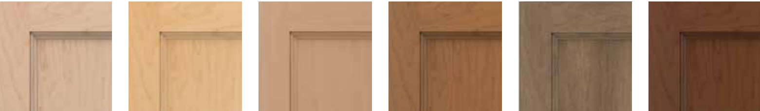
Unfinished B O M C Natural B O M C Jute B O M C Nutmeg B O M C Drift B O M C Cocoa B O M C