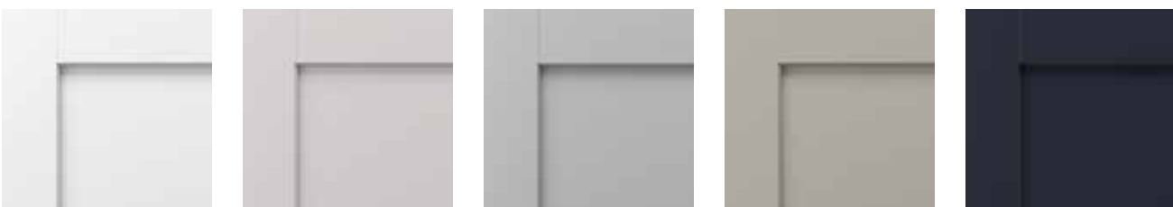
Sugar CB Shell CB Shadow CB Dune CB Harbor CB