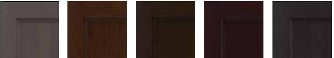
Graphite B O M C Saddle B O M C Clove B O M C Espresso B O M C Carbon B O M C