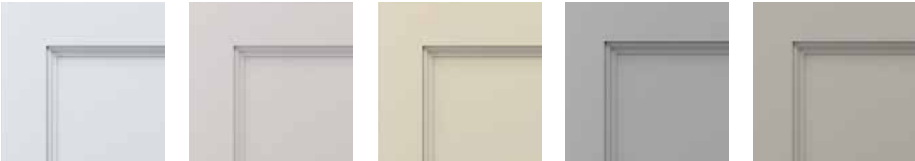
Alpine PH PO Salt PH PO Linen PH PO Greystone Pebble PH PO