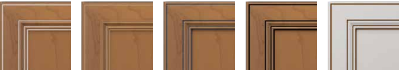
Alabaster Caramel Slate Chocolate Mocha (on paint only)