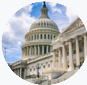
ESOP Policy and Advocacy