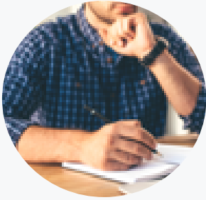
Member Benefits Chart