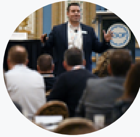
Events and Education