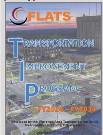
Image shown above is the Cover Page of the updated FY2024-33 TIP that was approved by FLATS Policy Committee in January 2024.