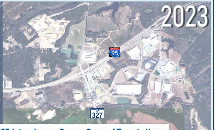
Considerable Growth around the I-95 & SC 327 Interchange Over a Span of Twenty Years