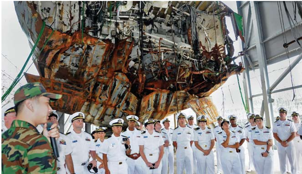
Officers assigned to the U.S. 7th Fleet command ship USS Blue Ridge examine the damage to the Republic of Korea navy corvette ROKS Cheonan . A non-contact homing torpedo exploded near the ship on March 26, 2010, sinking it, and resulting in the death of 46 ROK Navy sailors.