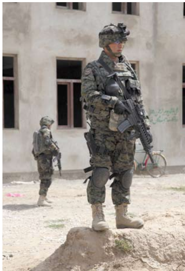
A South Korean service member with the Republic of Korea Provincial Reconstruction Team provides security while visiting Qal-Eh-Khoja village in the Parwan province of Afghanistan, August 31, 2010. The team was visiting the village to inspect a new school under construction.

However, to date South Korea's experience in these areas has been mostly small and has rarely involved facing the kind of threats that would build the kind of military expertise necessary for a North Korean