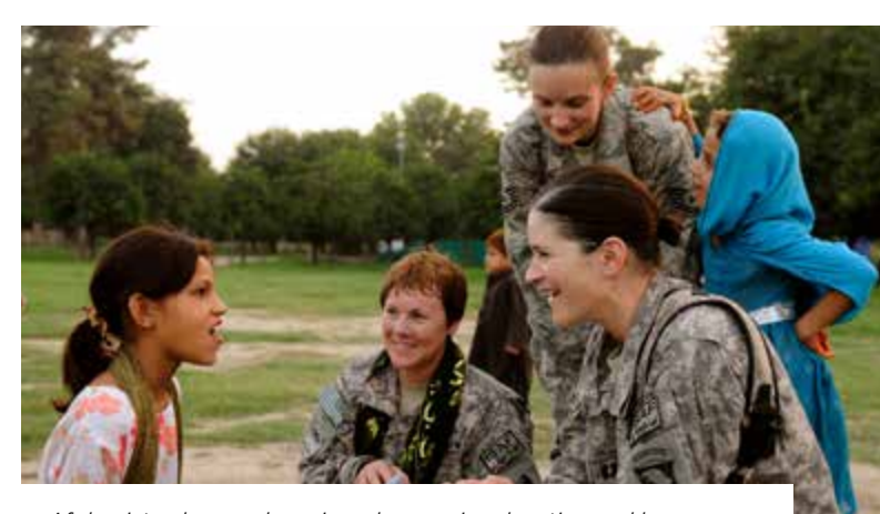
Afghanistan has made major advances in education and human rights since 2001. U.S. service members and an Afghan Girl Scout speak Pashto together in August 2010.

The most realistic prospect for a favorable and durable outcome is a gradual peace process that respects the dignity and sacrifices of Americans and Afghans and prevents the return of terror safe-havens. To bring this about, America needs a more focused approach.