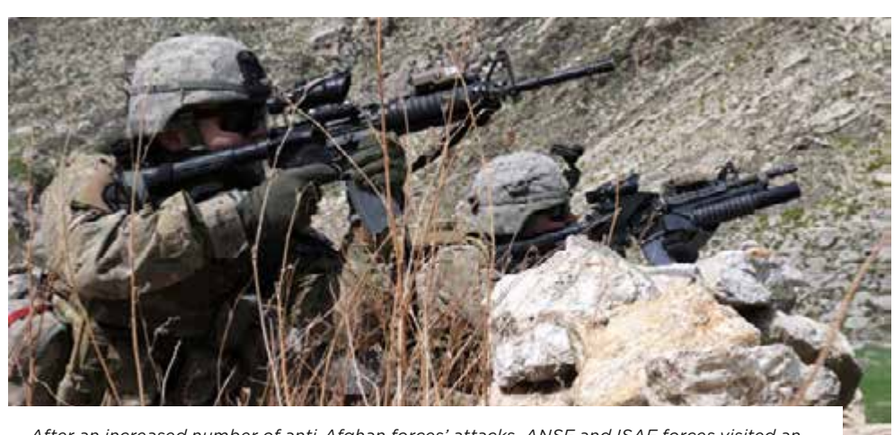
After an increased number of anti-Afghan forces' attacks, ANSF and ISAF forces visited an eastern region of the Kunar province and met with village elders. U.S. soldiers return fire after an attack.