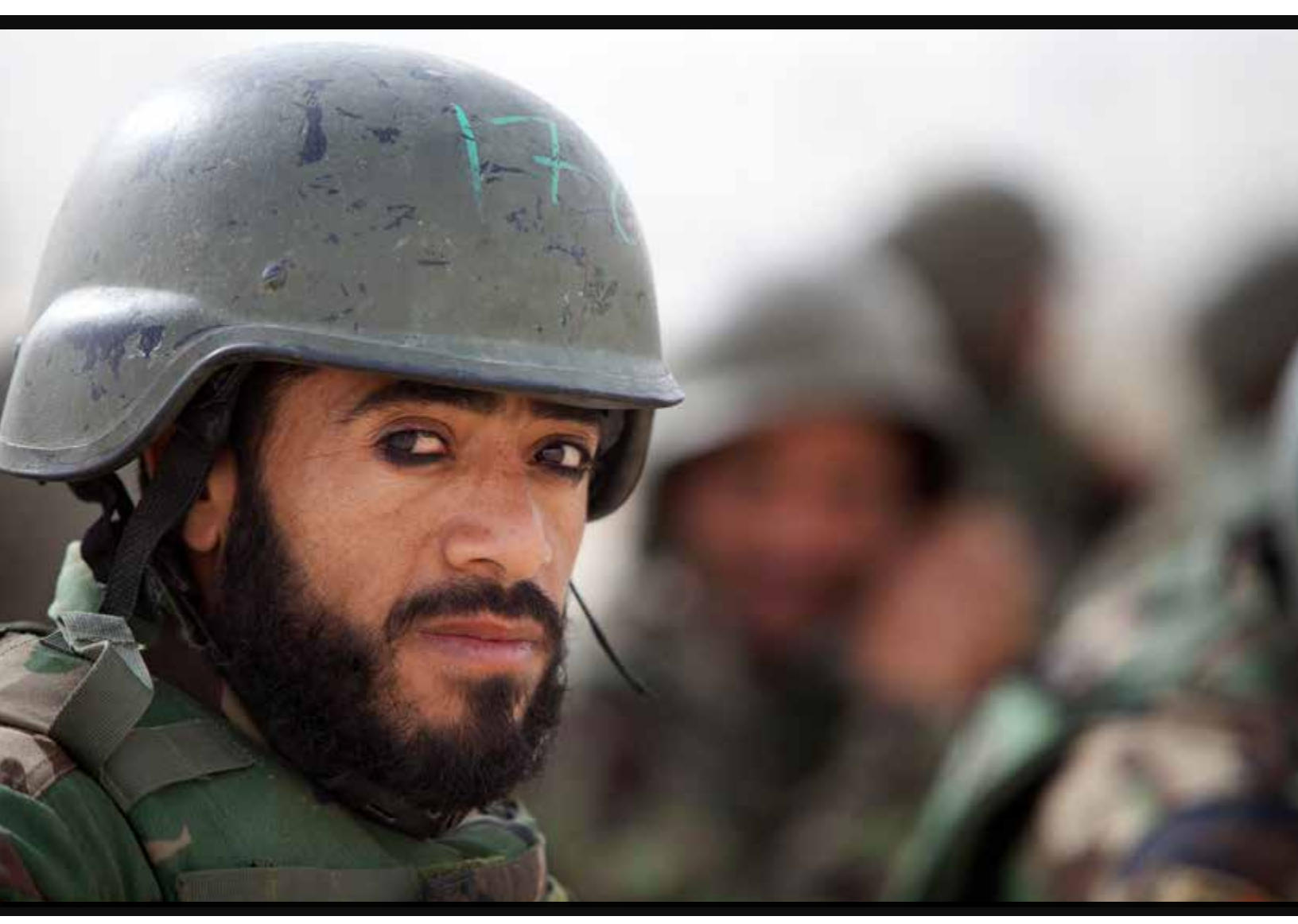
An Afghan National Army soldier participates in a live-fire training at Camp Shorabak in Helmand province in April 2013.