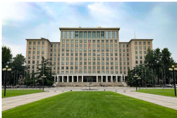
Tsinghua University, also known as “China’s MIT,” engages in classified Chinese military research to advance MCF goals. The university hosts many labs that support military research topics such as artificial intelligence, quantum physics, and nuclear technology.

Beyond the universities that are the “seven sons of national defense,” which have a long history of support to the military, 85 a range of Chinese universities are actively supporting MCF. 86 For instance, a growing number of universities have been designated by the State Administration for Science, Technology, and Industry for the National Defense (SASTIND) pursuant to “joint construction” (共建) programs. 87 Many universities have launched their own platforms for MCF or created national defense laboratories, often receiving funding from the CMC Equipment Development Department or Science and Technology Commission for their projects. 88 Meanwhile, certain universities are actively supporting military training and education, including in partnership with the new PLA Strategic Support Force, which wields the PLA’s space, cyber, and electronic warfare capabilities.