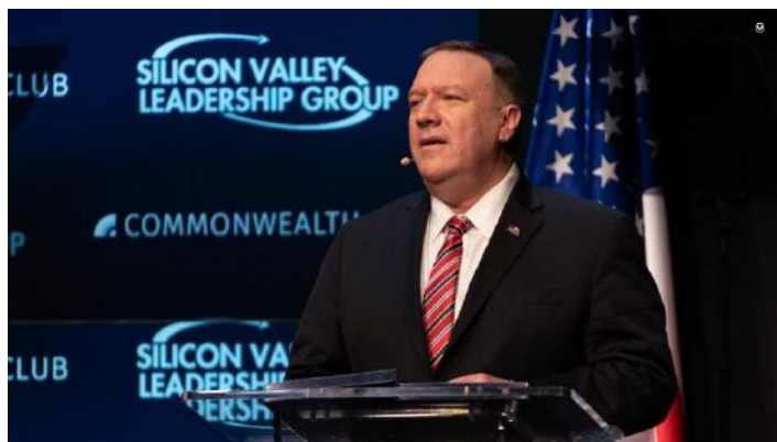
Then-Secretary of State Mike Pompeo addressed the Silicon Valley Leadership Group in January 2020, raising concerns about military-civil fusion and the implications for American companies, especially those involved in developing sensitive technologies.

In U.S. policy debates on China, military-civil fusion (MCF) has emerged as a frequent subject of debate and concern. Once a niche topic of study among only avid watchers of Chinese military modernization and defense technological development, Beijing's drive to break down barriers and create stronger linkages between its civilian economy and defense industrial base has started to draw considerable attention in Washington. 1 During Donald Trump's administration, Vice President Mike Pence, Secretary of State Mike Pompeo, senior officials across the State Department and Defense Department, and members of Congress all devoted time to MCF in speeches, using it to justify a broad range of policies. These included expanding investigations into intellectual property theft, banning Huawei from U.S. networks and critical infrastructure, urging companies like Microsoft and Google to stop working with Chinese counterparts, and even advocating for "decoupling" from the People's Republic of China (PRC), such as in supply chains and by limiting technological collaboration. 2 MCF has emerged as a key analytic driver of the intensifying economic and technological competition between the United States and the PRC in recent years. While Joe Biden's administration will have an opportunity to reset the tone of the U.S.-China relationship and recalibrate the use of instruments of U.S. policy, China's model of MCF is likely to remain a major concern for U.S. policymakers.