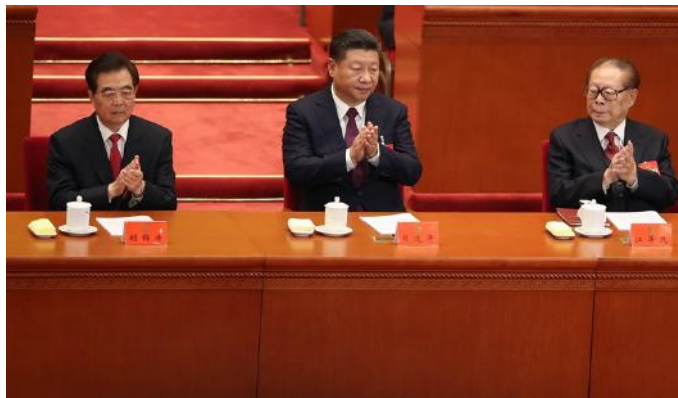
Chinese President Xi Jinping (center), along with former Chinese presidents Hu Jintao (left) and Jiang Zemin (right), attend the opening session of the 19th National People's Congress. In the 19th Party Congress' work report, Xi laid out lofty long-term aspirations for military-civil fusion.

Over the long term, China's authoritarian system—with its ability to implement top-down policies, compel compliance, and marshal resources for long-term industrial planning, enabled by large-scale investments—may afford China a structural advantage in MCF initiatives. 20 The most visible indication of this potential advantage is the amount of investment dedicated to MCF through state, hybridized, and commercial mechanisms. 21 Since 2015, there have been over 35 funds established that are dedicated to investing in firms related to MCF. The total for these MCF funds is estimated to have reached over $68.5 billion USD (447.16 billion RMB) in anticipated total funding (to be distributed over several years). 22 These funds continue to be created and expanded to