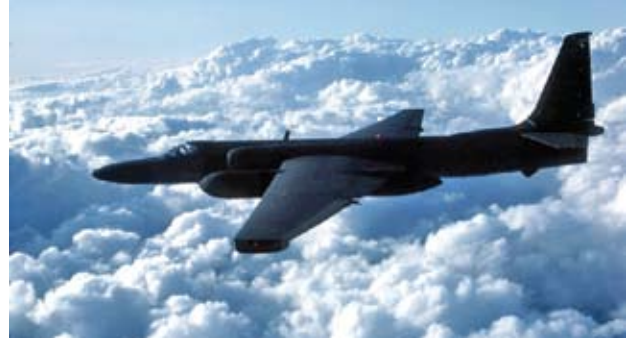
The U-2 "Dragon Lady," provides high-altitude, all-weather surveillance and reconnaissance, day or night, in direct support of U.S. and allied forces.

Historically many nations have fielded tactical reconnaissance aircraft. A partial inventory of U.S. Cold War-era tactical reconnaissance aircraft includes the RF-86F Sabre, the RF-4 Phantom and the photo pod-equipped F-15 Eagle (examples of fighter aircraft fitted for photo reconnaissance missions) and the P-2 Neptune and the P-3 Orion (a versatile maritime patrol aircraft with an ISR mission, and with specialized ISR variants such as the EP-3E ARIES). Japan's Self-Defense Forces have operated these P-2 and P-3 aircraft and their specialized ISR versions. 8