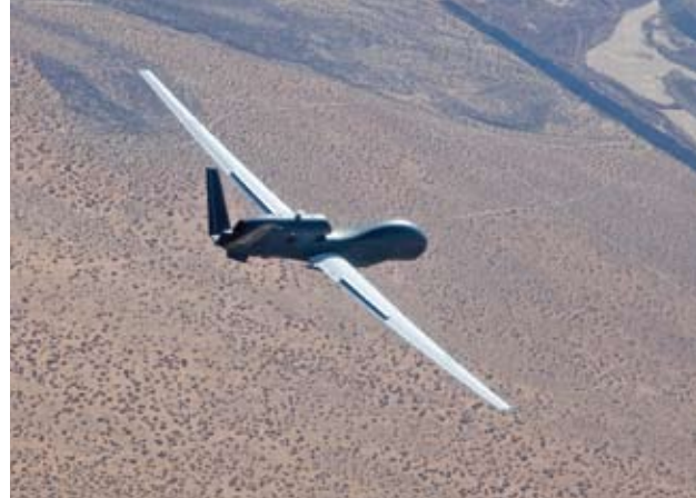
The RQ-4 Global Hawk is a high-altitude, long-endurance UAV with an integrated sensor suite that provides intelligence, surveillance and reconnaissance, or ISR, capability worldwide.

Several developments are driving the expansion of ISR capabilities and the intensity of ISR competition. First, space is no longer an exclusive enclave. Eleven nations are now orbiting ISR satellites, and that number is expected to increase to 12 in 2012. The international availability of commercial reconnaissance satellites means that both state and non-state actors can benefit from space-based ISR without the expense of national space programs. This commercial benefit is, of course, offset by the insecurity of commercial sources in times of crisis. Second, new sensor developments are making modern ISR cheaper, smaller and lighter. This affects the ISR chain at every level: Very sophisticated ISR payloads have become much easier to fly. Third, digitization of photography reduces problems of weight and expense. Despite their intense development in the mid-1950s, early U-2 camera magazines still contained two miles of very wide format film. Cumbersome in-flight aircraft recovery systems were designed to snatch film canisters ejected