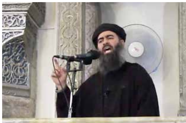
This image made from video posted on a militant website Saturday, July 5, 2014, which has been authenticated based on its contents and other Associated Press reporting, purports to show the leader of the Islamic State group, Abu Bakr al-Baghdadi, delivering a sermon at a mosque in Iraq in what would be a rare - if not the first - public appearance by the shadowy militant.

Second, the competitive organizational politics of the extremists in Syria and Iraq may increase the chances that the groups – now focused on seizing and keeping territory and routing enemies in Syria and Iraq – could shift focus toward planning attacks in the West. ISIS was formed among members of the defeated al Qaeda in Iraq in 2010-2011 and until recently served as core al Qaeda's affiliate in Iraq. Its stated goal has always been to defeat the Iraqi government and replace it with an Islamic caliphate. Over the course of its evolution fighting the Asad regime in Syria, however, ISIS began clashing with al Qaeda. Disagreement and rivalry began emerging between Baghdadi, the ISIS chief, and the head of AQ, Ayman al Zawahiri. Jabhat al-Nusra was a splinter of ISIS that had been sent to Syria by Baghdadi to establish al Qaeda in Syria.