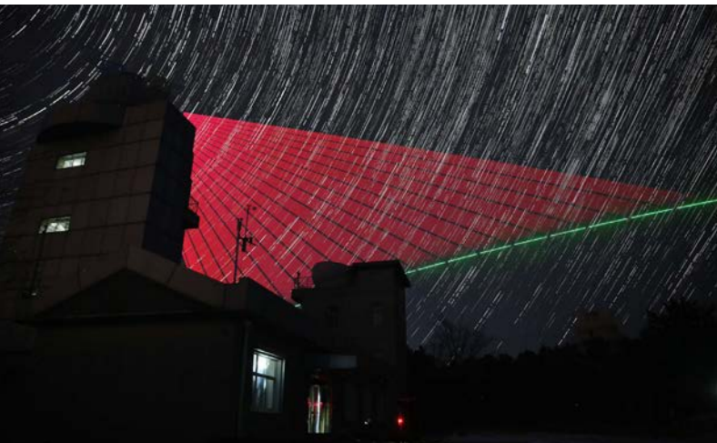
The link between China's quantum satellite and a ground station in Tibet is pictured at night. Micius may be the first step to a future "quantum internet" that scales up secure communications within China and worldwide.

Looking forward, China likely will leverage its advances with Micius to reinforce its global leadership in quantum communications.