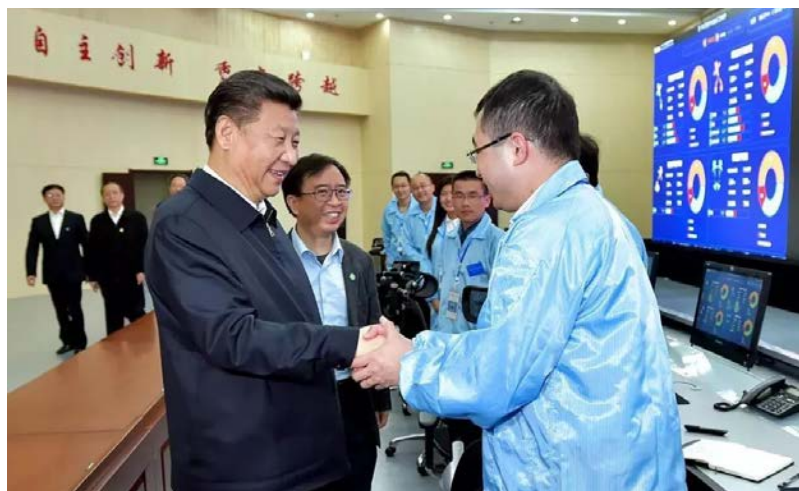
Xi Jinping visited the University of Science and Technology of China in April 2016, and he is pictured here standing next to Pan Jianwei, China's most prominent quantum scientist. Xi's personal attention to quantum technologies is a strong indicator of the high-level importance of this domain.

Regardless, the result of these security concerns has included an intensified focus on quantum communications, considered more secure against cyber espionage, and on quantum computing, which has the