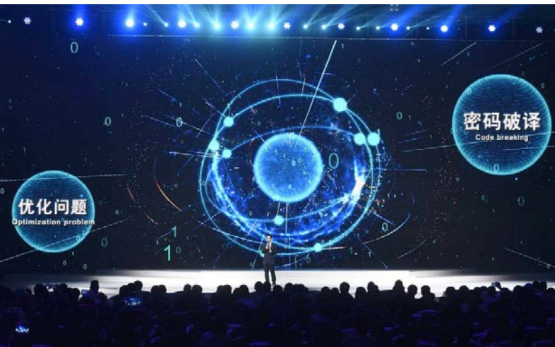
Leading Chinese quantum physicist Lu Chaoyang describes the applications of quantum computers during a presentation in Wuzhen.

2018, researchers achieved experimental entanglement of 25 quantum interfaces that linked stationary qubits in quantum memory. 188 In May 2018, Chinese scientists from Shanghai Jiao Tong University and the USTC developed a photonic chip that can enable two-dimensional “quantum walks” of single photons in real space, which might boost analog quantum computing. 189