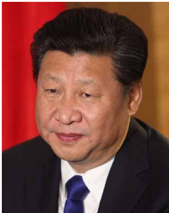
Chinese President Xi Jinping has put the narrative of national rejuvenation and the achievement of a “China dream” at the center of his governing agenda. This has coincided with a significant increase in aggressive Chinese behavior, especially in the South China Sea.

These tendencies are compounded by the paradox that China is a status quo domestic power—seeking to preserve its one-party rule—while openly asserting a major shift in the post-World War II global order. Maintaining internal political order is the primary focus of China’s leadership. And the legitimacy of the Communist Party of China is inseparable from the delivery of prosperity, security, and national pride. These points are evident when President Xi Jinping speaks of a “China dream” and China’s “great rejuvenation.” But Xi’s determination to advance his country’s wealth and power is not automatically a win-win proposition for