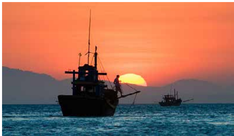
The livelihoods of some 300 million people depend on the South China Sea’s ample resources, from fishing off the southeast coast of Vietnam (shown here), to vast hydrocarbon reserves, to vital shipping lanes.

More generally, the principal narrative glosses over the vital role the United States has played—and continues to play—in promoting prosperity and the rule of law in the region. In his otherwise positive review of Rachman’s book, former Assistant Secretary of State for East Asian and Pacific Affairs Kurt Campbell singles out this propensity to dismiss the resiliency of the United States. 20 The economic rise of Japan, South Korea, and Taiwan owe a great deal to U.S. postwar policy. Further, as previously suggested, the institutions built by the United States and others in the aftermath of World War II remain central pillars of contemporary international order. This hardly precludes new mechanisms and arrangements, but while those demonstrate their ability to follow through with sustainable, transparent public goods, existing institutions such as the Bretton Woods system (including the World Bank, the International Monetary Fund, and the Asian Development Bank) and