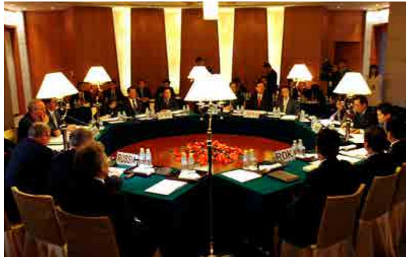
Clockwise, envoys from Russia, the United States, North Korea, Japan, China, and South Korea meet at the beginning of a round of negotiations, in December 2008, in Beijing, China. The envoys met for talks on mothballing North Korea's nuclear program, amid dire predictions for progress in the negotiations. The six parties also held a series of bilateral meetings in Beijing before sitting down for formal talks.

The six-party talks demonstrated that agreeing on a verification protocol is the toughest stage in the denuclearization process. Transparency is considered fatal to the tightly controlled regime in Pyongyang. 50 It remains to be seen in future negotiations whether some of the challenges experienced during the six-party talks still need to be resolved today. 51 One challenge at the time was agreeing on the verification activities nuclear experts were allowed to conduct. For example, Pyongyang was opposed to inspectors taking environmental samples and conducting forensics at the facilities that were to be dismantled in Yongbyon. Negotiations today would require an agreement on the verification measures and the facilities or sites to conduct them.