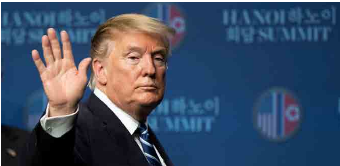
U.S. President Donald Trump attended a news conference following his second summit meeting with North Korean leader Kim Jong Un on February 28, 2019, in Hanoi, Vietnam. Trump and Kim abruptly cut short their two-day summit as talks broke down and the leaders failed to reach an agreement on nuclear disarmament.

Bold and creative approaches could certainly lead to historic breakthroughs and perhaps even put an end to what has become an intractable problem. It is vital for any deal(s) to continue to serve the interests of the United States and South Korea and lead to stability in Northeast Asia.