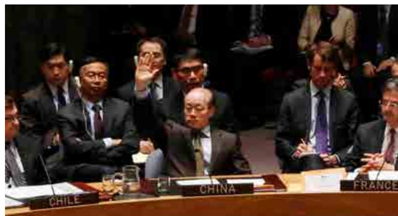
China's Ambassador to the United Nations Liu Jieyi votes against a measure to adopt the agenda of human rights violations in North Korea during a meeting of the United Nations Security Council to discuss North Korea on December 22, 2014, in New York City. The U.N. Security Council was deliberating the human rights conditions in North Korea for the first time.

While it is imperative for Washington and Pyongyang to conclude a denuclearization-peace roadmap at the earliest possible date, negotiations remain fluid, and there are several ways to begin the denuclearization process. For example, at the next summit, the two leaders could strike a mini deal before or during working-level negotiations for a roadmap, especially if either or both come under pressure to showcase results to their domestic and international audiences. But any mini deal(s) should be made in the context of an overarching roadmap that commits North Korea to complete denuclearization.