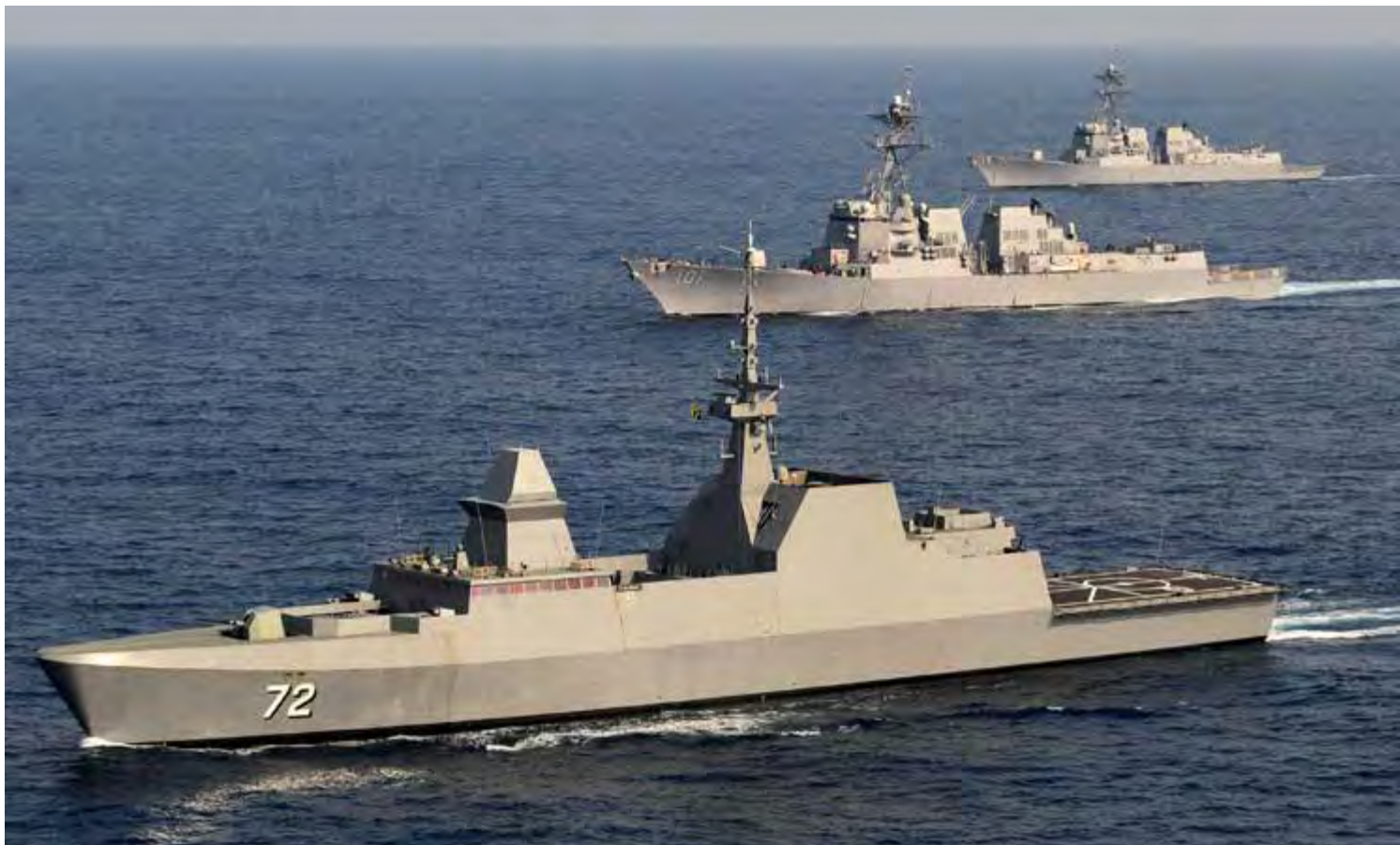
In 2012 the Republic of Singapore Navy frigate RSS Stalwart deployed alongside U.S. guided-missile destroyers USS Gridley (center) and USS Stockdale (far right).