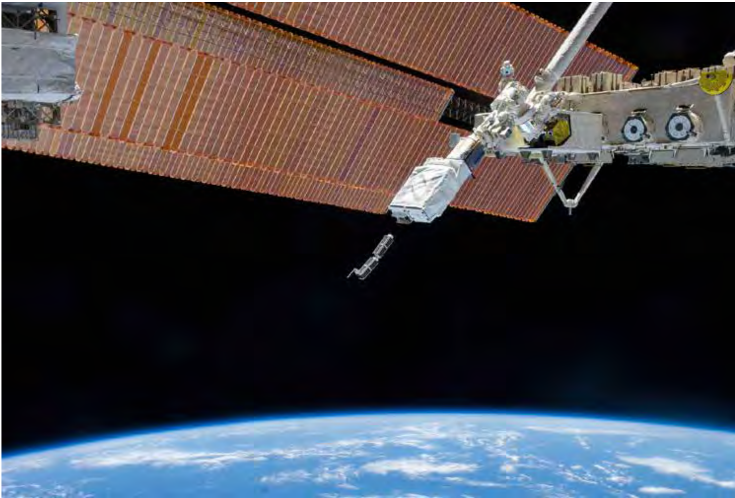
Inexpensive, small satellites (or “cube sats”) are lowering the cost of geospatial information by offering high-quality commercial imaging. Here, Planet Labs cube sats are launched from the International Space Station.

shortfalls in ISR capacity. 46 Their statements are particularly notable because CENTCOM and PACOM generally are the highest-priority commands for resourcing. Between the two of them, they are likely getting the lion’s share of U.S. military ISR assets. Yet gaps still remain.