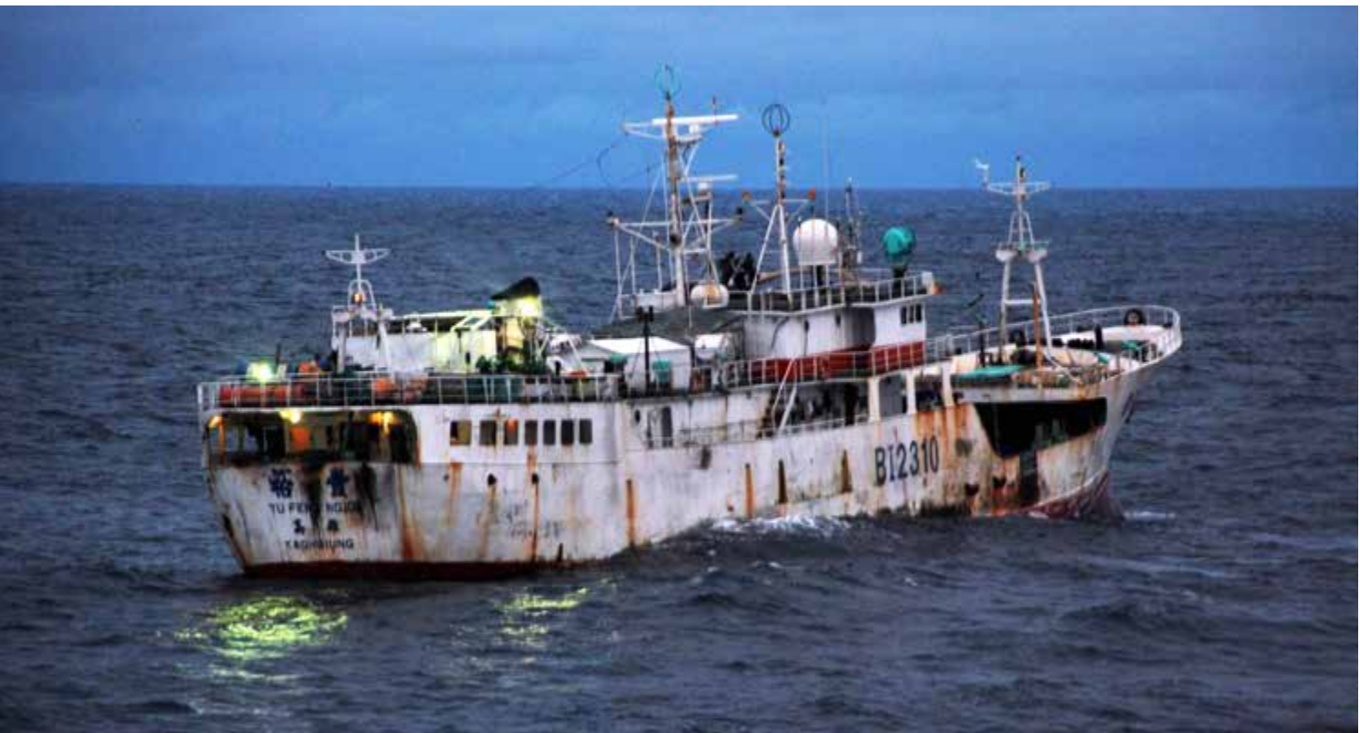
The Taiwanese-flagged fishing vessel Yu Feng shortly before being boarded by law enforcement on suspicion of illegal fishing in 2009.

Governments across Southeast Asia have signaled an appetite to combat the epidemic of illegal fishing. In 2007, 11 Southeast Asian and Pacific Island nations – Australia, Brunei Darussalam, Cambodia, Indonesia, Malaysia, Papua New Guinea, the Philippines, Singapore, Thailand, Timor-Leste, and Vietnam – signed the Regional Plan of Action to Promote Responsible Fishing Practices (RPOA). This agreement commits governments to jointly ending IUU fishing and coordinating best practices of fisheries conservation, though most signatories face challenges with governmental capacity to monitor and enforce it. 25 And although it can raise the ire of neighbors, Asian states have adopted certain deterrent practices. Not only have Southeast Asian governments begun prosecuting illegal fishing crews even when hailing from other countries, but they have also started a practice of burning or blowing up the captured ships. 26 Thailand, Vietnam, Malaysia, Indonesia, China, and the Philippines have all either conducted these prosecutorial practices or had ships and citizens subjected to them.