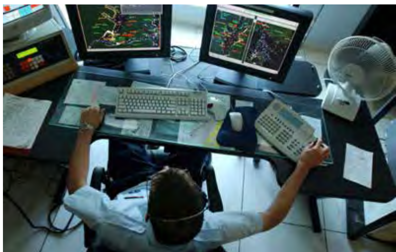
AIS transponder data, especially when combined with other sensor platforms like radar systems, provide crucial information for maritime domain awareness. Here, the New York Harbor's Vessel Traffic Center monitors port traffic. (Wikipedia)

While AIS and ADS-B are valuable publicly available tools, they establish only an initial baseline for situational awareness. They