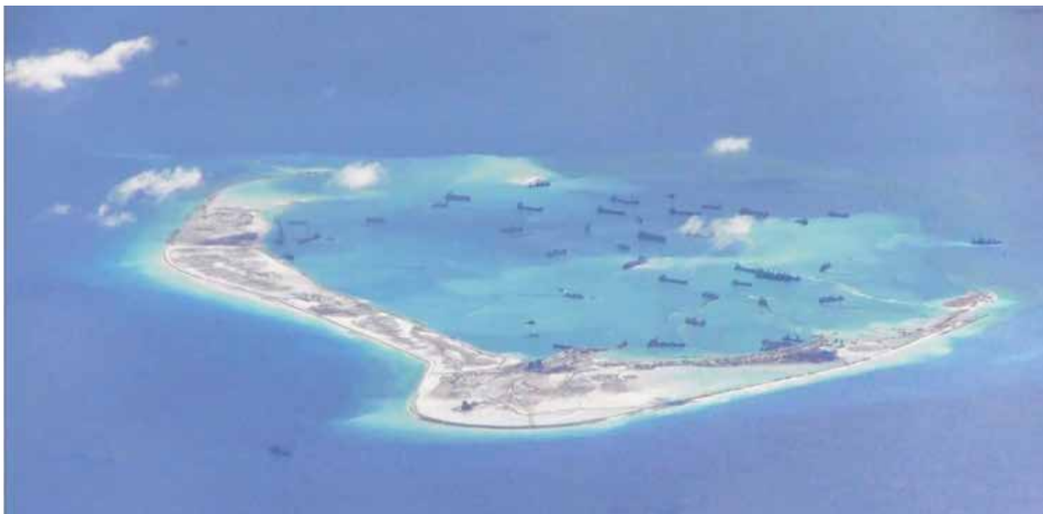
Surveillance video from a U.S. Navy P-8A Poseidon as it flies over Chinese island building efforts in the South China Sea in May 2015.

Between early 2014 and mid-2015, Beijing converted seven formerly submerged reefs and rocks into artificial islands using commercial dredging techniques. China has since begun installing military facilities and equipment on these islands. This includes sophisticated radar and communications equipment, high-capacity port facilities, and as many as three 3,000-meter airstrips, all of which are capable of landing any military aircraft that China possesses. Admittedly, China is not the only South China Sea claim-