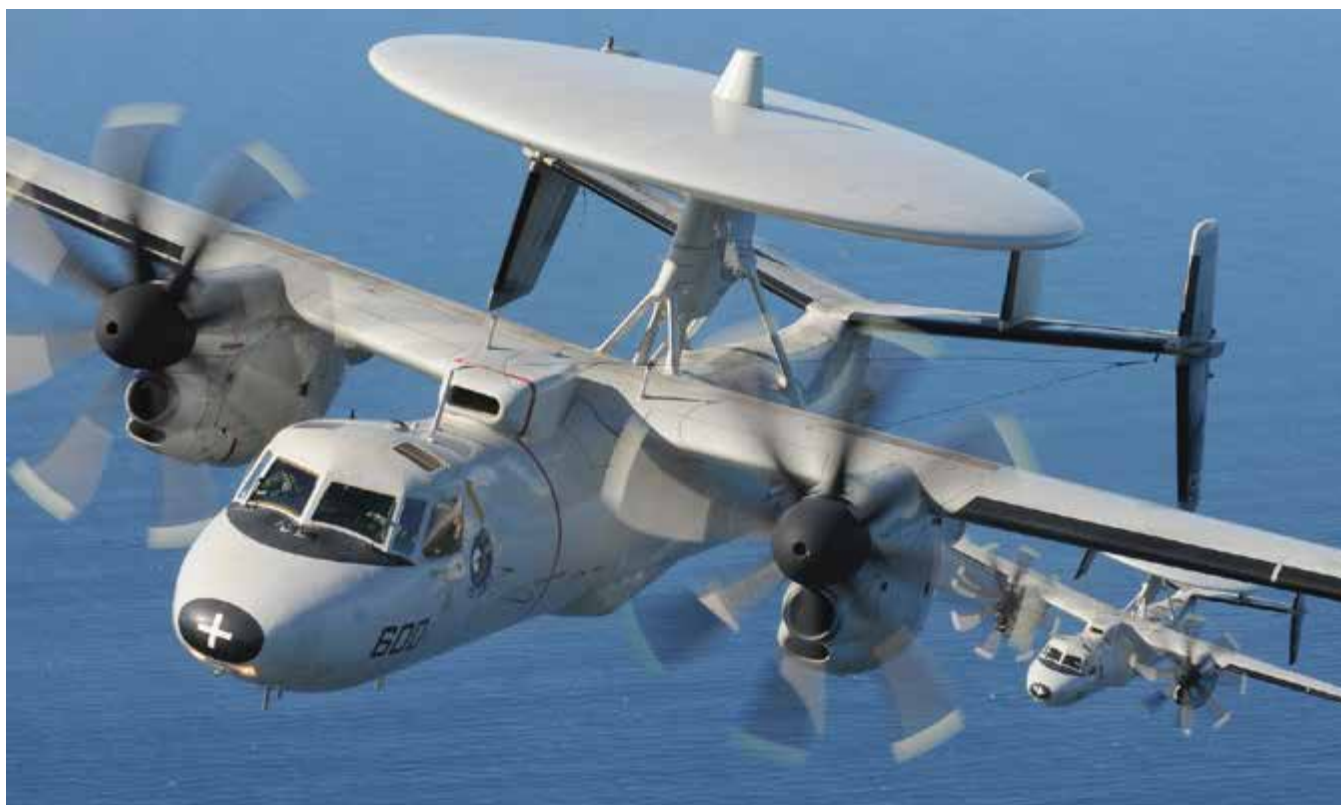
Early warning ISR capabilities, such as those provided by this E-2C Hawkeye operating over the Pacific Ocean, are still lacking among many Southeast Asian countries.

As the Pentagon's Asia-Pacific Maritime Security Strategy advertises, the United States is already doing much to improve the maritime awareness capacity of select Southeast Asian countries. The United States has aided Malaysia with coastal surveillance radar stations. It is providing assistance constructing the Philippines Coast Watch System. It is transferring a number of small patrol vessels to the Philippines. And it is supporting Indonesia's effort to enhance MDA through a number of activities. But these efforts are a pittance compared with what is needed for actionable situational awareness. Most maritime Southeast Asian militaries still lack aerial reconnaissance, rudimentary electronic warfare and signals intelligence, and airborne early warning capabilities; all have only limited maritime patrol and reconnaissance capacity. Current U.S. efforts improve regional capability only on the margins.