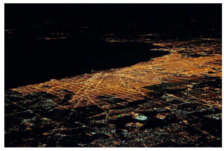
5G networks will form the backbone of critical infrastructure such as power grids.

The promise of 5G is alluring. New capabilities—autonomous vehicles, telemedicine, a true Internet of Things that connects millions of devices, machines, objects, and people—enabled by much greater bandwidth at higher speeds and lower latency than is possible today are expected to transform the U.S. economy and society. 5G also has important national security applications, such as improved military communication and situational awareness. There are also likely to be innovations and use cases we have yet to conceive of. 5G means advances across a spectrum of industries, with novel foundational technology serving as the backbone for critical infrastructure. A common refrain is that 5G could be one of the most consequential technological innovations in human history, ushering in a fourth industrial revolution in a few years' time.<sup>8</sup>