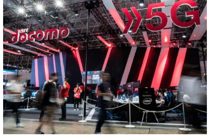
A few days after NTT DOCOMO exhibited at the Tokyo Game Show 2019 in September, the company announced it would launch 5G services based on O-RAN Alliance specifications.

The open RAN approach is the most promising of all the options because it lays a groundwork for innovative and competitive solutions. There is potential to shift a global industry in a fundamental way. These grassroots industryled initiatives show that the needed interest and desire are there, even in a risk-averse industry. What are missing are large-scale proof points. This is why national-level governments need to step in with signaling and incentives to nudge these solid ideas on the path toward broad adoption.