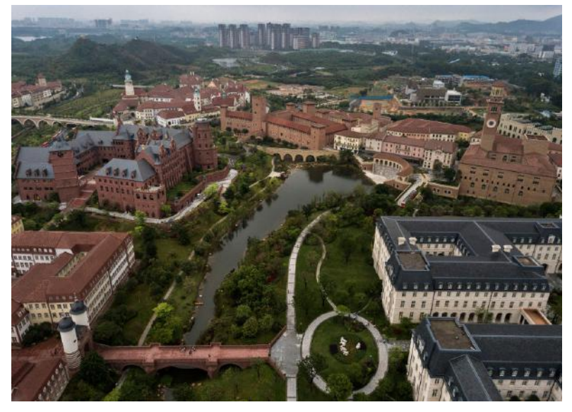
Huawei has a sprawling research and development (R&D) campus in Dongguan, China. Together with Nokia, Ericsson, and Samsung, the company dominates the global market for radio access network equipment.

What makes the supply chain issue particularly vexing is that Chinese industrial policy all but ensures the oligopoly will persist, and likely worsen, as Nokia, Ericsson, and Samsung face growing hurdles to compete. Beijing supplied Huawei with as much as $75 billion in