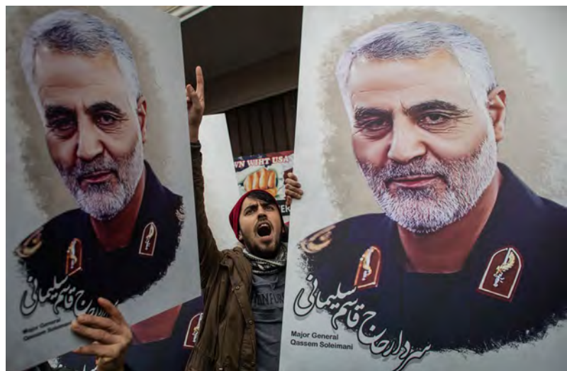
Demonstrators protest the death of IRGC-QF leader Qassim Soleimani in front of the U.S. consulate in Istanbul, Turkey, on January 5, 2020. Outrage across the Middle East was sparked after the United States killed Soleimani.

The strike also resulted in immediate fallout in Iraq, which viewed unilateral U.S. military actions against