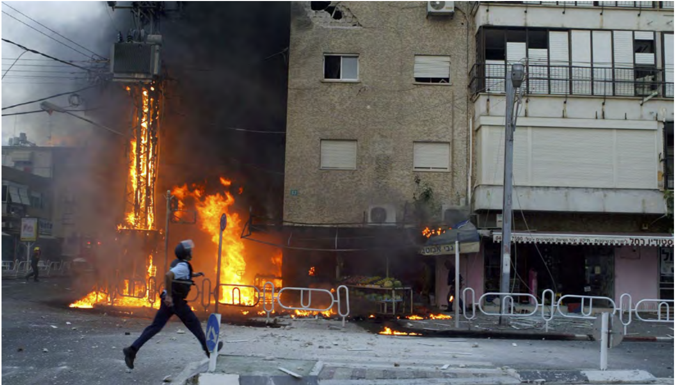
Hezbollah rockets launched from Lebanon strike the town of Nahariya, Israel, in July 2006. Lebanese Hezbollah serves as a direct proxy of Iran, and is tasked with spreading the Islamic Revolution and confronting Israel.

Iran's leading nemesis, Israel. 12 In its early years, Hezbollah was a useful tool for Iran to directly target U.S. and Israeli interests—to project power outside of Iran's borders, and to do so while reducing the risk of direct U.S. or Israeli military retaliation. The most salient examples of this approach include the bombings of the Marine barracks in Beirut and the American embassy, as well as the kidnapping of Americans—all without drawing any direct retaliation on Iran. Even as late as 2012, the IRGC-QF, through Lebanese Hezbollah, sponsored a terrorist attack on Israeli tourists in Bulgaria. 13 Beyond these types of attacks, which are designed to demonstrate the long reach of the IRGC-QF to its adversaries, Lebanese Hezbollah has also allowed Iran to dramatically increase its political influence in Lebanon. This allows Iran the potential to apply pressure on Israel.