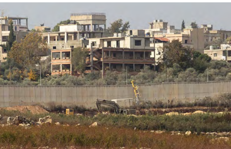
Israeli military engineers work to destroy Hezbollah tunnels in December of 2018. In addition to exposing and destroying Hezbollah cross-border tunnels, in 2018 Israel also dropped roughly 2,000 bombs in its strikes against Iranian targets in Syria.

In addition to destroying weapon shipments, Israel now needed to calibrate its efforts against Iran to degrade its military capabilities; deter it from building the more permanent presence it desired; and deter Iranian and Iran-backed forces from launching attacks on Israel. 34 Israeli officials proceeded strategically, leveraging high quality intelligence to hit high value Iranian targets quietly, with limited casualties, in order to minimize the risk of escalation while degrading the threat. Israel struck Iranian weapons and rocket depots, Iran's command headquarters, and intelligence and logistics sites around Damascus. 35 As part of this effort, Israel also exposed and destroyed Hezbollah cross-border tunnels. 36 In 2018 alone, Israel dropped roughly 2,000 bombs in its strikes against Iranian targets in Syria. 37