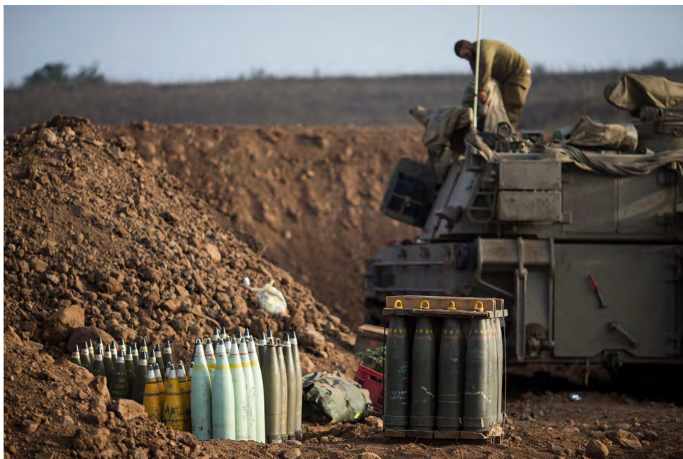
Israel's Artillery Corps readies itself in the Golan Heights in September 2013. Israel has demonstrated that military options do not need to be taken entirely off the table when trying to counter Iran.

limited operations inside Syria. It may be possible that this assumption was correct, given the state of the Assad regime's air defenses in 2013 and the broader objectives that any U.S. intervention may have tried to achieve. However, the effectiveness of Israeli operations certainly calls into question this assumption by U.S. military planners and should provoke questions about whether the United States had more creative limited military options at its disposal that could have impacted the outcome of the Syrian civil war or at least done more to protect civilians.