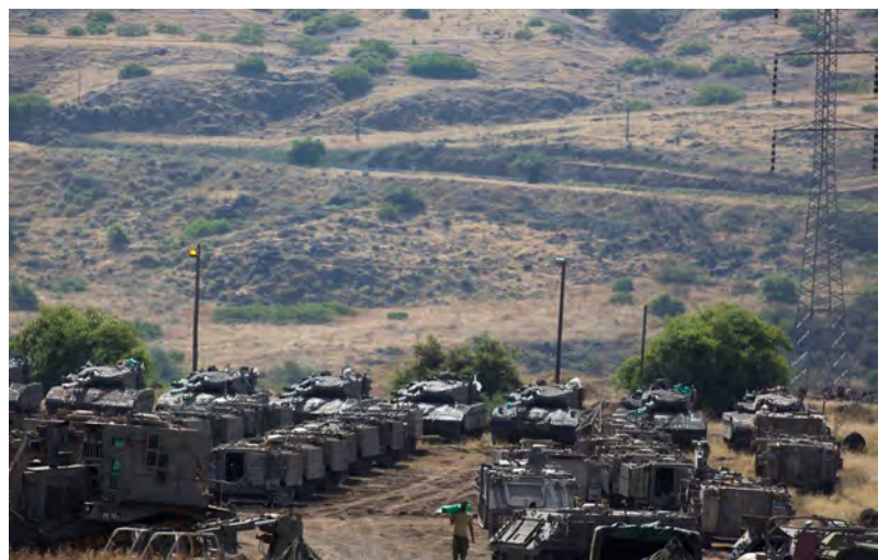
In May 2018 Israeli tanks were positioned in the Golan Heights near the Syrian border, after Iran-backed militias fired 20 rockets targeting Israeli military bases. If Iran and Hezbollah were able to establish a large enough arsenal of precision guided munitions, they could overwhelm Israel's Iron Dome system and, in the process, threaten Israel's civilian population in northern Israel.

Keeping this very sharp focus on a limited objective has allowed Israelis to zero in on a narrow set of targets while having the maximum effect and reducing the likelihood of escalation by not widening the lens. It has also helped the Israelis establish deterrence vis-à-vis the Iranians, because it has become clear to all the players