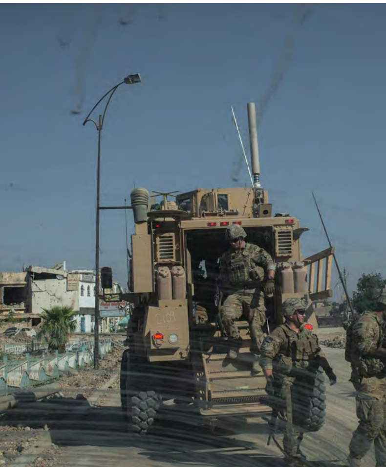
A U.S. Army 82nd Airborne Division mine resistant ambush protected vehicle (MRAP) traverses western Mosul in June 2017 as a part of the U.S. commitment to support Iraqi forces in the fight against ISIS.

Finally, in recent hostilities in Iraq, Iranian-supported militias had for months been launching rocket attacks at U.S. bases. When a U.S. contractor was killed on December 27, 2019, the United States responded with attacks on five Kata'ib Hezbollah bases in Iraq and Syria, killing 25 fighters. Less than two days later, members and supporters of Kata'ib Hezbollah stormed the U.S. embassy in Baghdad, setting fire to parts of the reception office. In response, the United States launched a drone strike that killed the leader of Iran's IRGC-GF, Qassim Soleimani, alongside Iraqi Popular Mobilization Units leader Abu Mahdi al-Muhandis. Four days later, Iran launched 22 ballistic missiles into Iraq, targeting U.S. personnel at two military installations, al-Asad air base and another base in Erbil. The Pentagon confirmed that the attack injured more than 100 U.S. troops stationed at the two bases. In this case the U.S. response was forceful, but it also led to the closest the United States and Iran have come to a highly escalated direct conventional conflict that ultimately would have been in neither's interest.