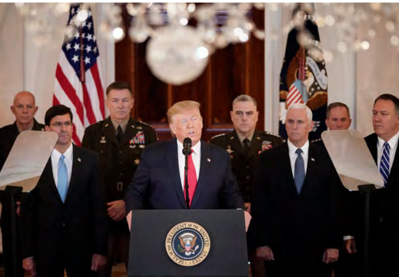
U.S. President Donald Trump addresses the Iranian missile attacks that hit two Iraqi air bases, al-Asad Air Base and a base in Erbil, both of which stationed U.S. troops. President Trump announced that the United States would not take any immediate action in response to the attack.

Finally, a key lesson from the mabam campaign has been to focus on clearly defined and limited objectives. But in the case of Soleimani, the U.S. government had a hard time clearly defining its justifications or its