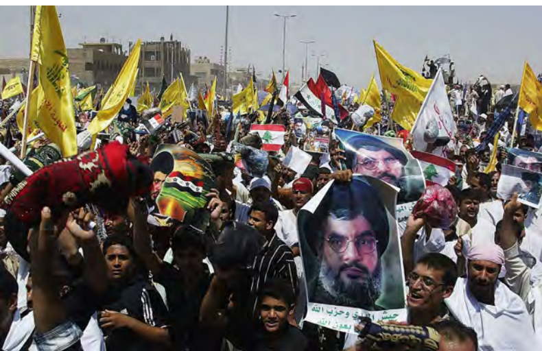
Iraqi protesters wave Hezbollah, Lebanese, and Iraqi flags while also holding pictures of Hezbollah leader Hassan Nasrallah. Iran has developed and trained numerous Iraqi Shia militia. Thousands of fighters from these groups became part of the IRGC-QF Hezbollah network.

also combined this approach with a political strategy that made use of its relationships with numerous Shia politicians. IRGC-backed groups in Iraq were responsible for the deaths of roughly 600 Americans in that country between 2003 and 2011. This network of Shia militias was also embedded into Iraq's Hashd al-Shaabi (Popular Mobilization Units [PMU]) organization, which fought ISIS between 2014 and 2018 and is now an official security structure subordinate to the Iraqi prime minister's office. 18 The IRGC-QF backed PMU groups have entered into Iraqi politics, further expanding the social, political, and security power that Iran has over Iraqi affairs and the Iraqi state. 19