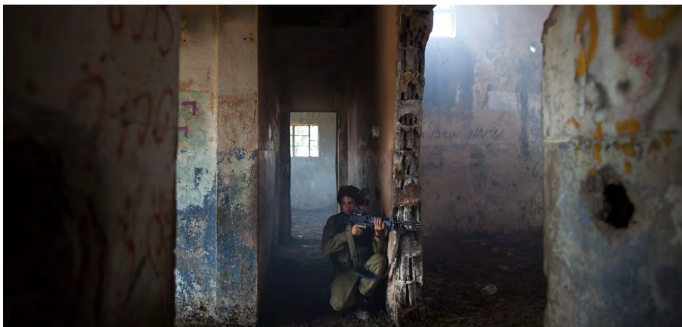
Israeli soldiers of the Golani Brigade participate in a May 2013 exercise in the Golan Heights. The heightened presence of Israeli soldiers at the Israeli-Syrian border came after Syria accused Israel of launching airstrikes near the Lebanese-Syrian border.

For Iran, Syria serves as a route to the Mediterranean, a bridge to Iran-backed Lebanese Hezbollah, and an additional front with Israel. As such, Syria is a major part of Iran's gray zone strategy to extend its influence in the Middle East and to apply pressure on Israel, one of its two major adversaries in the region. When the 2011 uprisings in Syria began, Iran saw the threat of the overthrow of a key ally. But over time it also came to see an opportunity to redefine its influence over a weakened Syrian government, and Iran's on-the-ground presence in Syria is part of its current strategy to establish itself as a dominant regional power. 25 Whereas before the uprisings the Assad regime functioned more as an ally, with occasional disagreements and sometimes differences in policy goals, later the IRGC-QF aimed to turn that regime into a client state. The civil war in Syria has allowed Iran to influence and shape the functioning of the deep state that supports Bashar al-Assad's rule, which includes the elite security and intelligence services that are primarily led