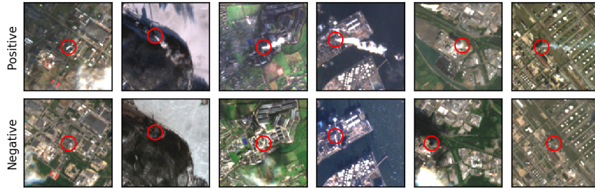
Figure 1: A representative sample of example images. Each column corresponds to a different location; the top row shows locations when a smoke plume is present (positive class), the bottom row shows the same locations during the absence of smoke (negative class). Red circles indicates the approximate origin of the plume. Our data set samples a wide range of seasonal effects, climate zones, land use types, and natural cloud patterns.

This work investigates the possibility to quantify GHG emissions by using industrial smoke plumes based on satellite imagery as a proxy. The goal of this ongoing project is to establish a pipeline to monitor the state and level of activity of industrial plants using readily available remote sensing data in an effort to estimate their GHG emissions in combination with environmental data.