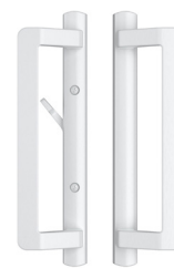
View Handle (Option)

White Black exterior / White interior Oil rubbed bronze (Paint) Satin Nickel