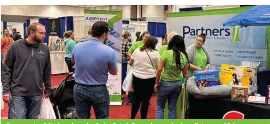
Partners 1st FCII booth at the Baby Fair & Expo that took place February 25th

Apply by May 31, 2023, at https://www.partners1scu.org/u-want-to/save-for-college.