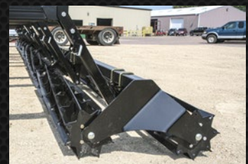
DOUBLE ROLLING BASKET