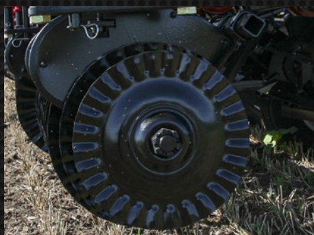
Incizor Blades® INCIZOR®