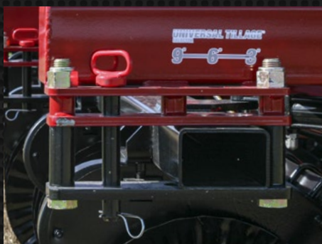
Universal Tillage Selector