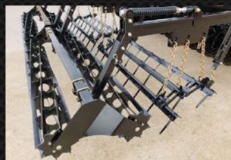
3-BAR FLEXIBLE SPIKE TOOTH HARROW WITH DOUBLE ROLLING BASKET