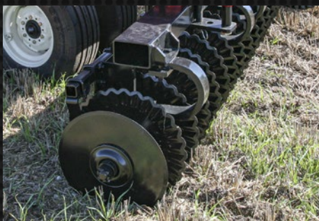
COBRA DISK BLADES