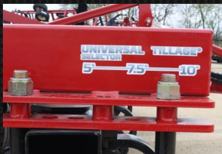
UNIVERSAL TILLAGE® SELECTOR