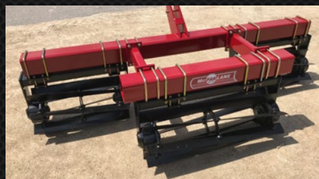
15 foot option