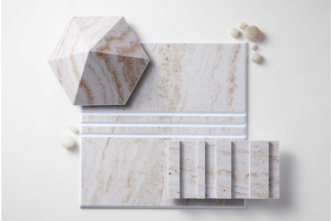
Product shown: Diamond Tile, Racetrack Path Tile, and Barcode Tile in Kirei Ink (Travertine)

Please note: Kirei requires written permission from the copyright holder in order to reproduce any copyrighted work. Professional photographs cannot be reproduced without written permission from the photographer.