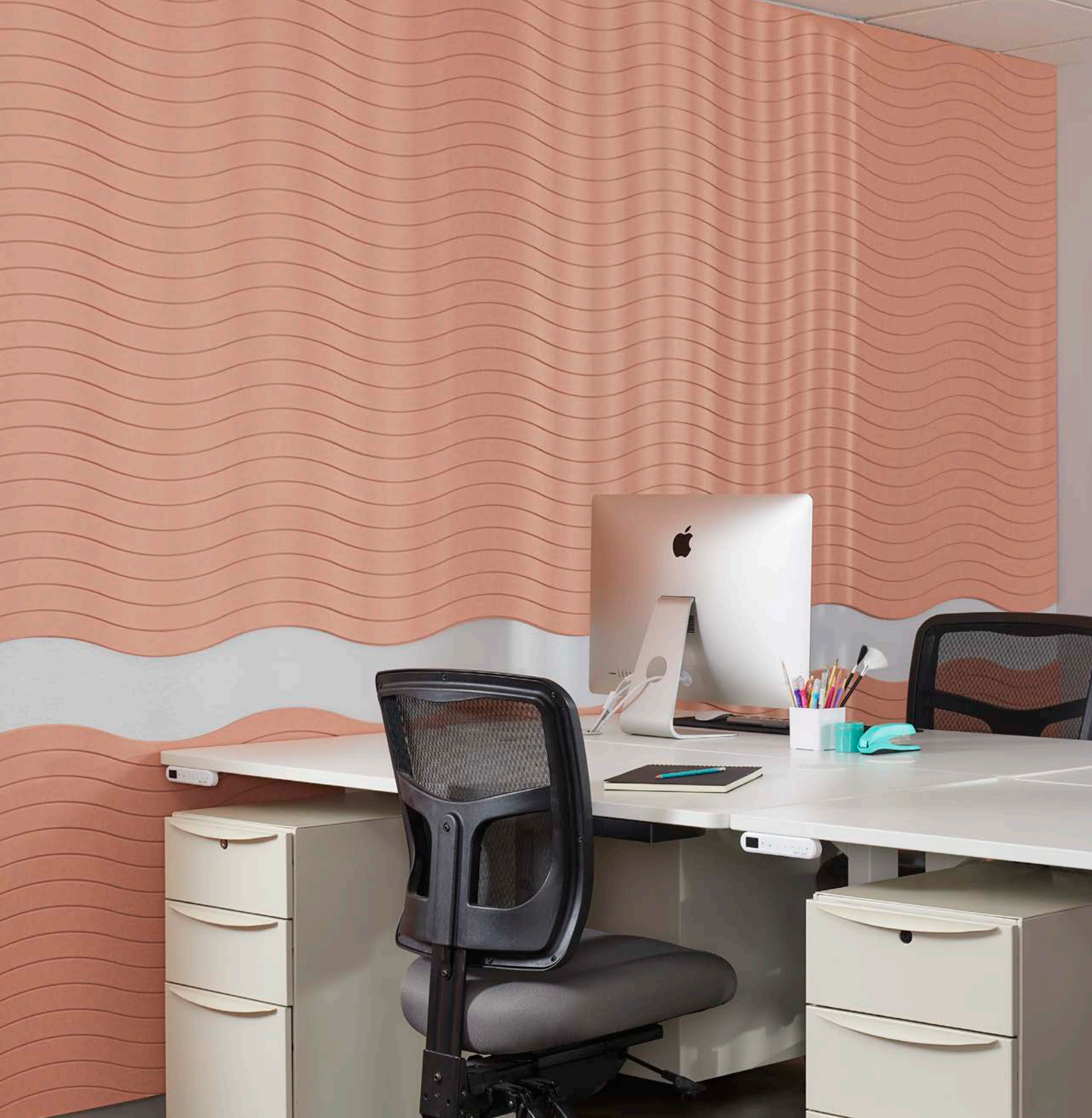
Product shown: Wavy Panels in Blush