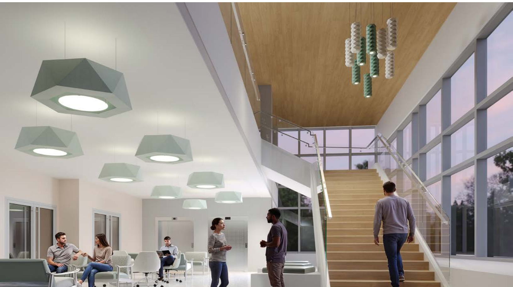
Product shown: Tessellate Pendant Lit in Frost and Jade, Tessellate Pendant Cloud Lit in Mint