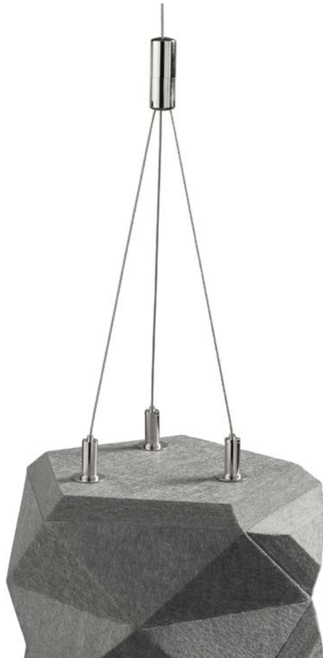
Cable Splitter Hardware

Note: Kirei does not provide ceiling mounting hardware or cable/chain/rod.