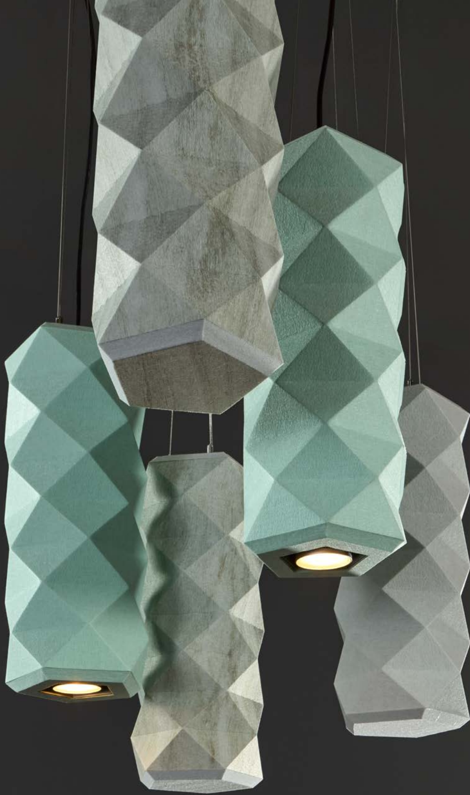
Product shown: Tessellate Pendant Lit in Mint Tessellate Pendant in Frost and Frost with Kirei Ink (White Wash)