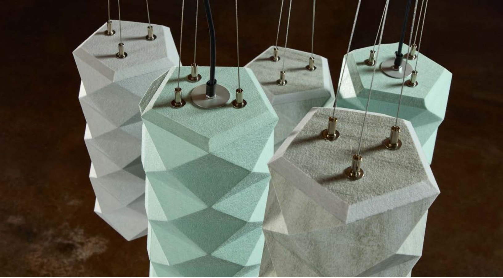
Products shown: Tessellate Pendant Lit in Mint Tessellate Pendant in Frost and Frost with Kirei Ink (White Wash)