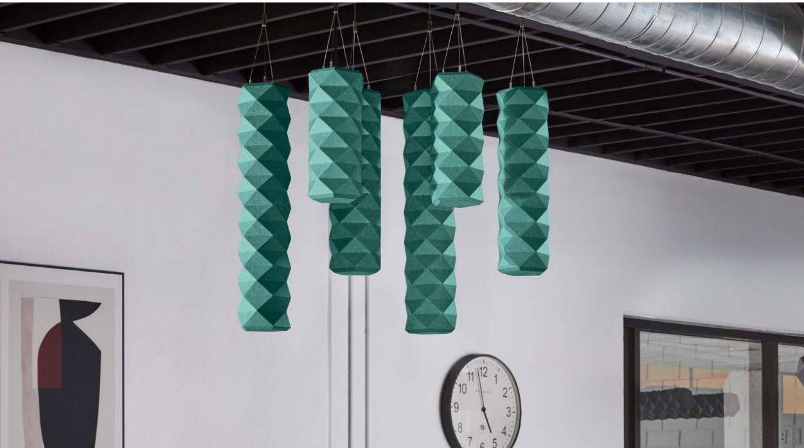
Product shown: Tessellate Pendant in Jade