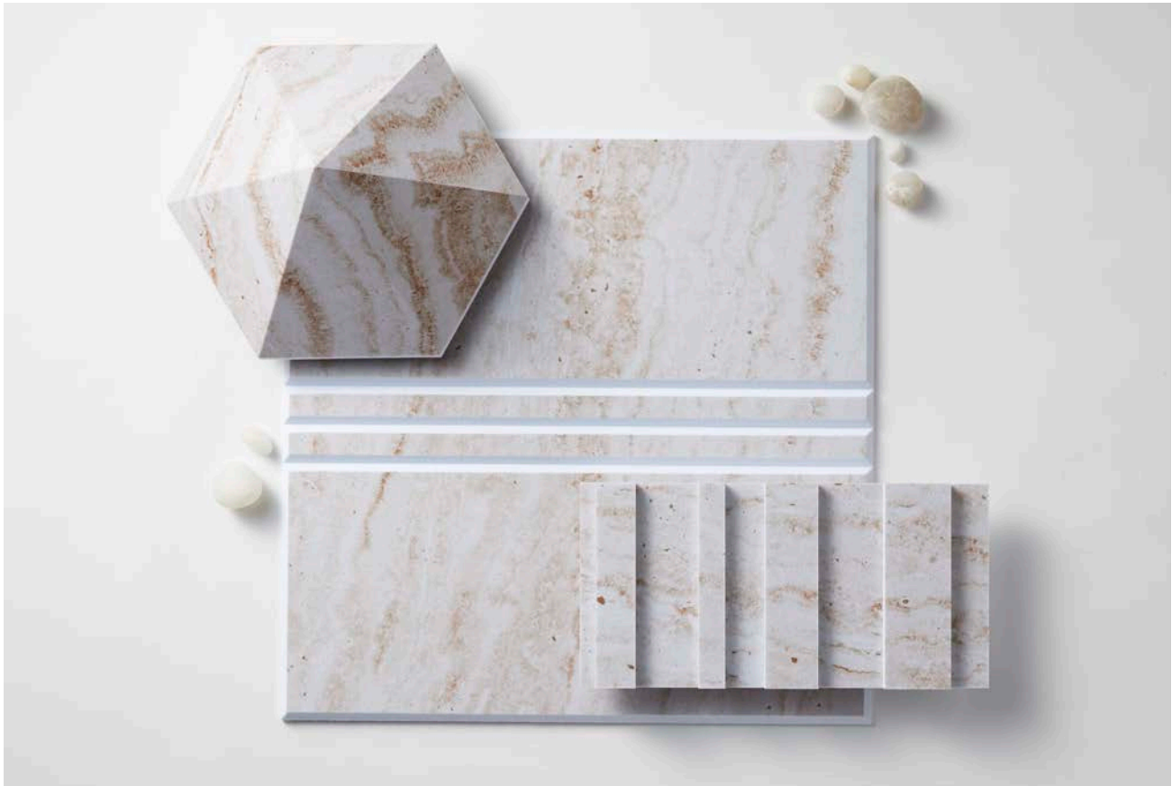
Product shown: Diamond Tile, Racetrack Path Tile, and Barcode Tile in Kirei Ink (Travertine)

Please note: Kirei requires written permission from the copyright holder in order to reproduce any copyrighted work. Professional photographs cannot be reproduced without written permission from the photographer. Keep in mind printing is not on the edges of the fully assembled product.