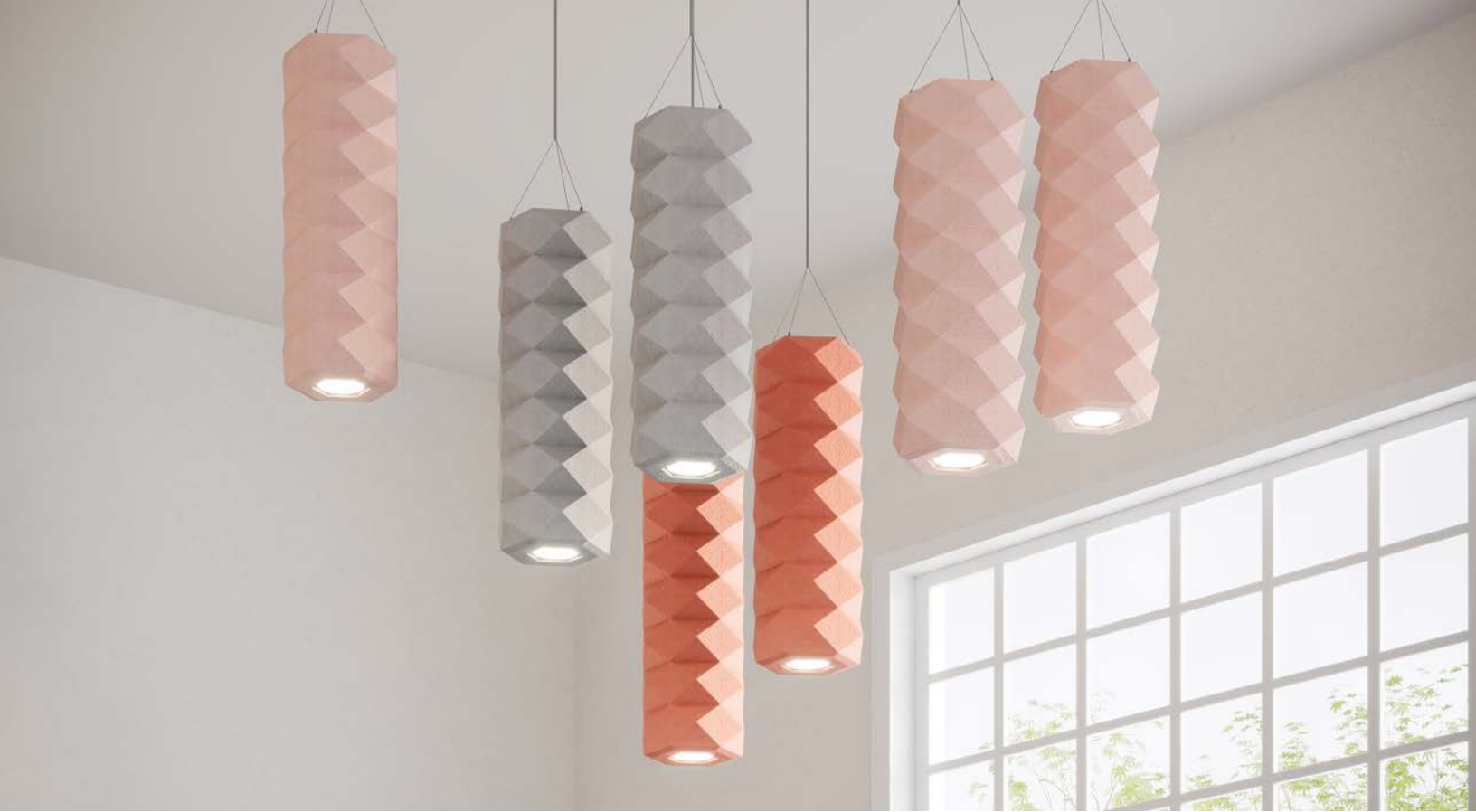
Products shown: Tessellate Pendant Lit in Gray, Blush, and Dusky