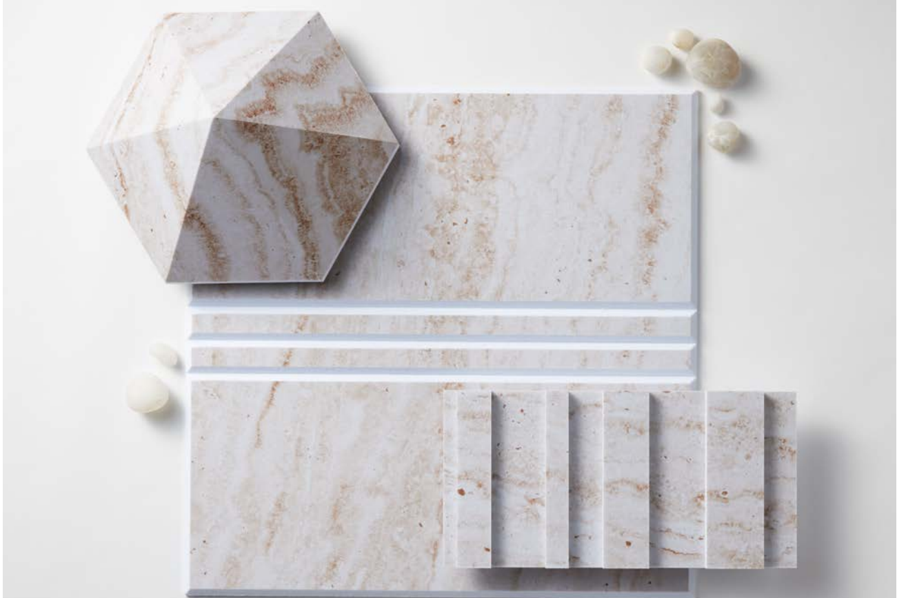
Product shown: Diamond Tile, Racetrack Path Tile, and Barcode Tile in Kirei Ink (Travertine)

Please note: Kirei requires written permission from the copyright holder in order to reproduce any copyrighted work. Professional photographs cannot be reproduced without written permission from the photographer.