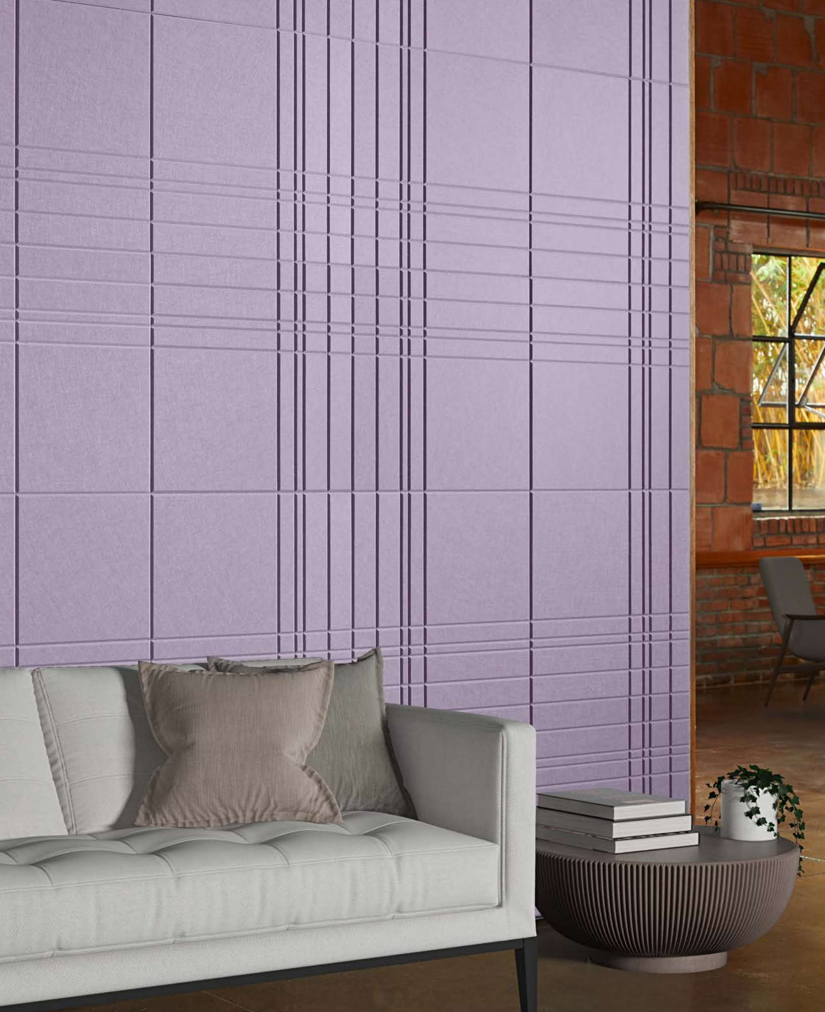
Product shown: Tartan Tiles in Orchid