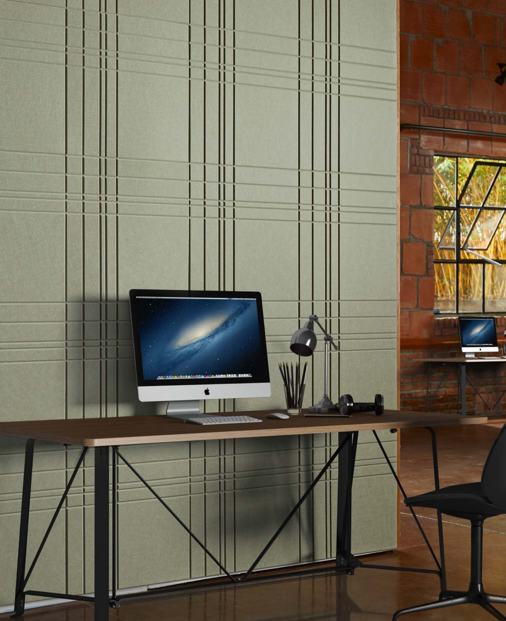
Product shown: Tartan Tiles in Sage