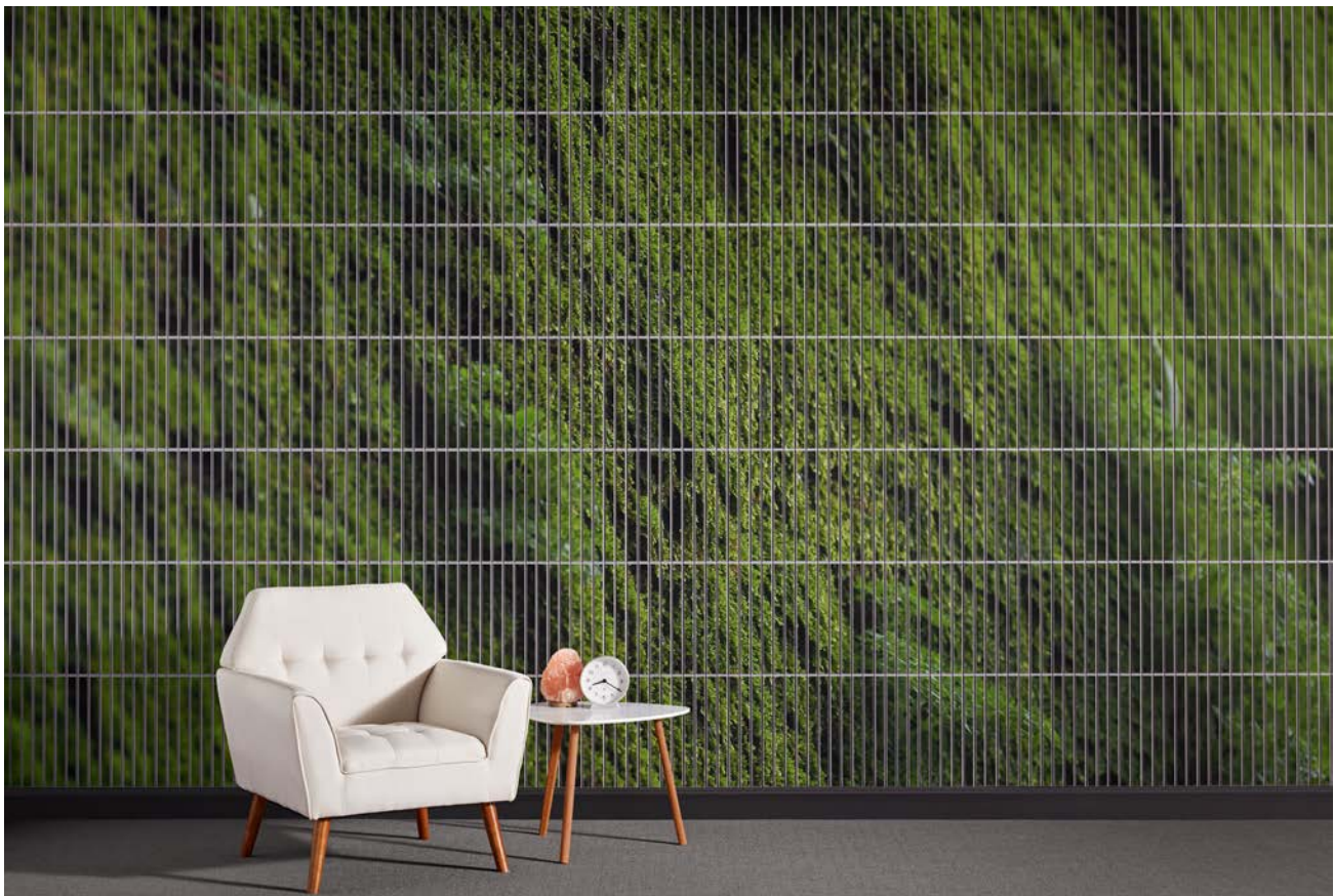
Product shown: Roman Panels with Kirei Ink (Custom Print)

Please note: Kirei requires written permission from the copyright holder in order to reproduce any copyrighted work. Professional photographs cannot be reproduced without written permission from the photographer.