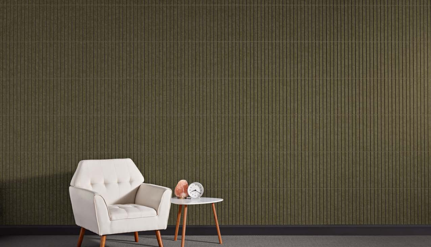
Product shown: Roman Panels in Olive