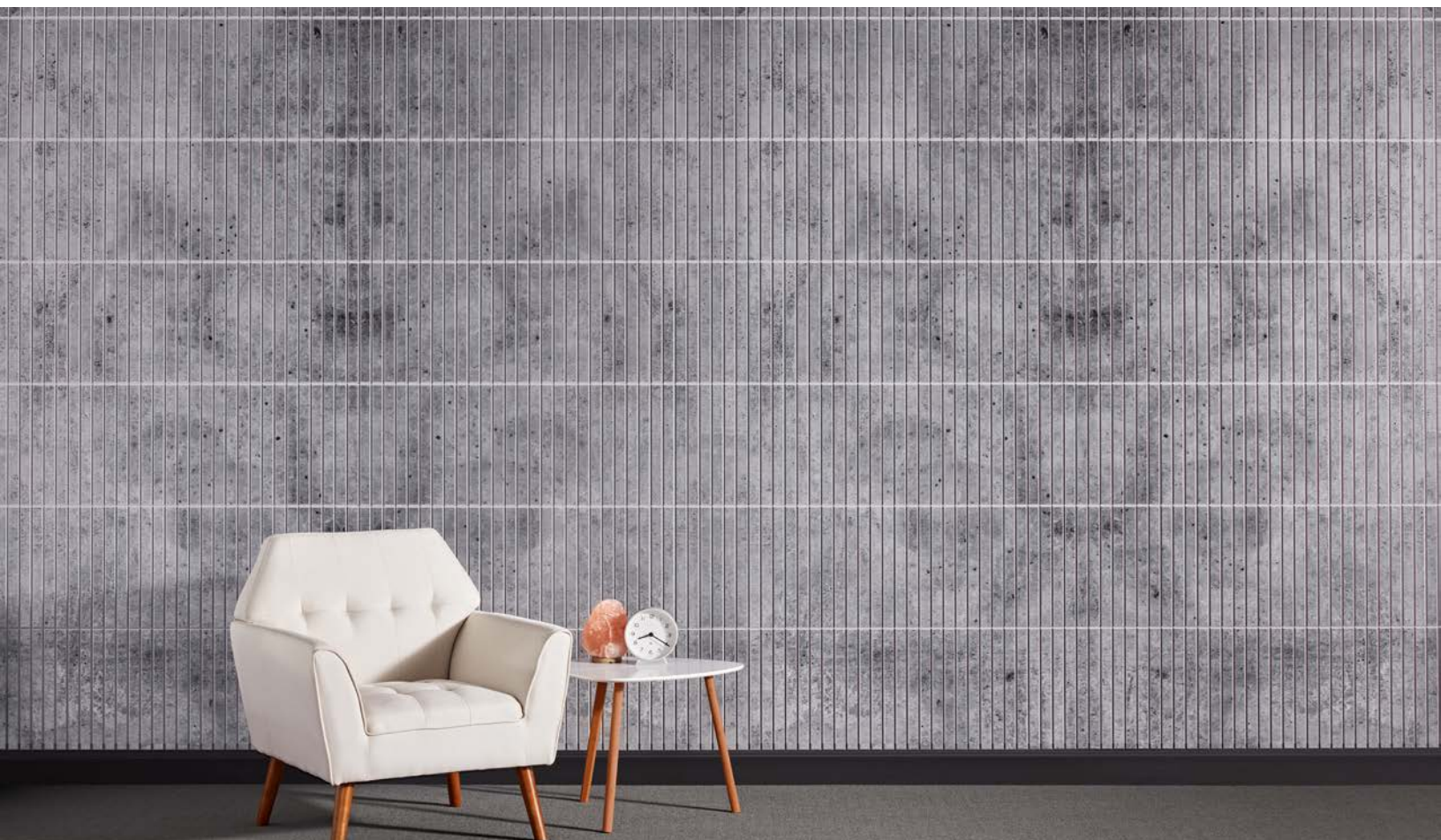
Product shown: Roman Panels with Kirei Ink (Concrete)