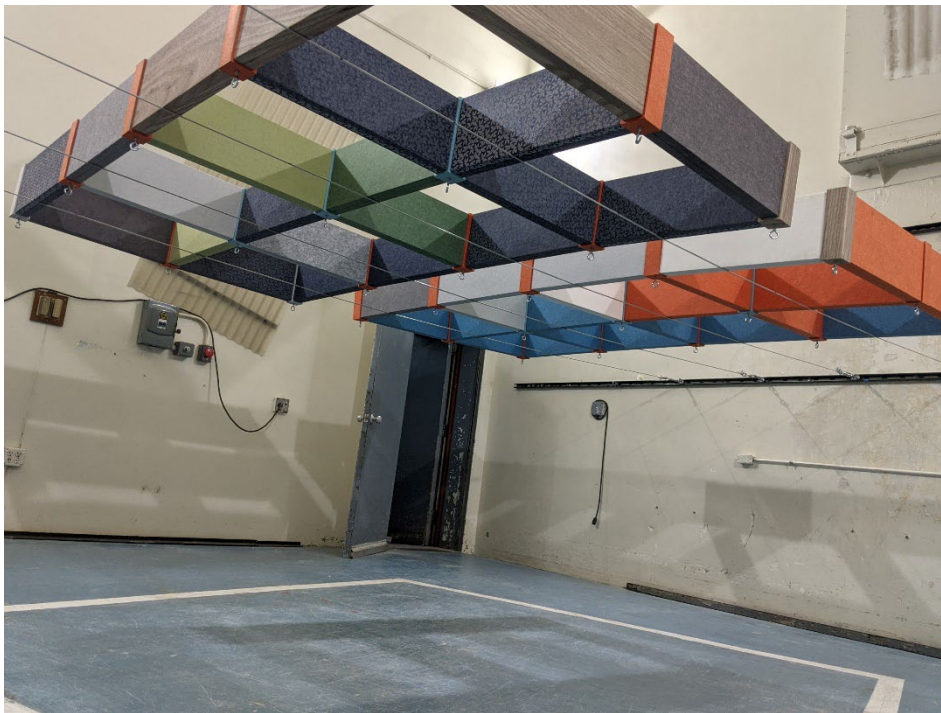
Figure 2 – Specimen mounted in test chamber