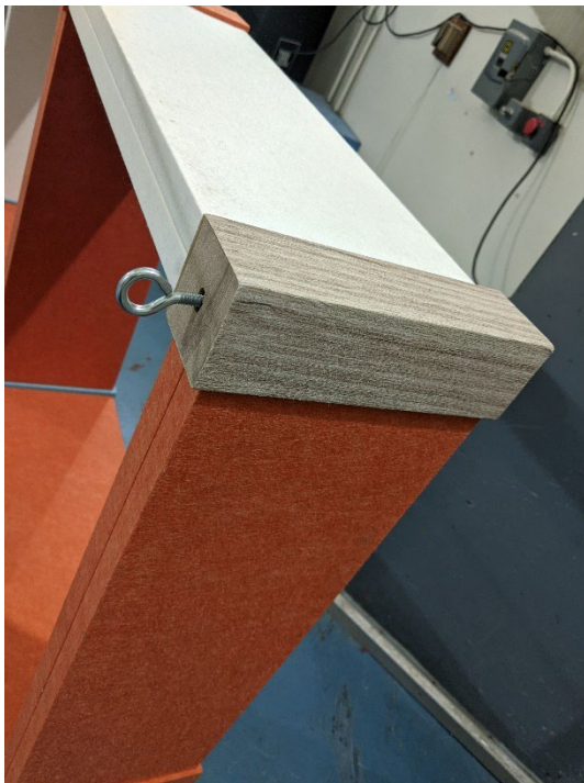
Figure 4 – Detail of specimen materials