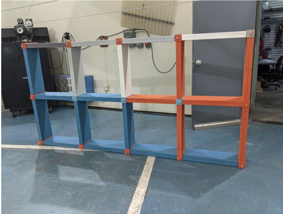
Figure 3 – Individual specimen cloud baffle