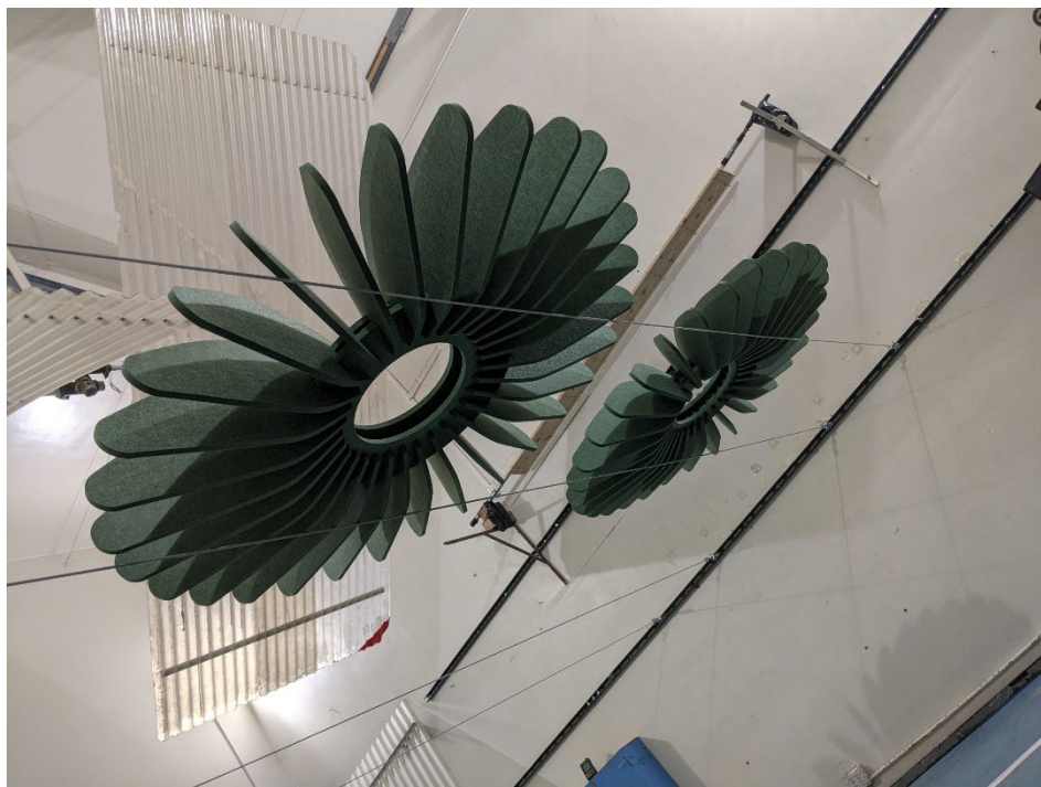
Figure 2 – Specimen mounted in test chamber