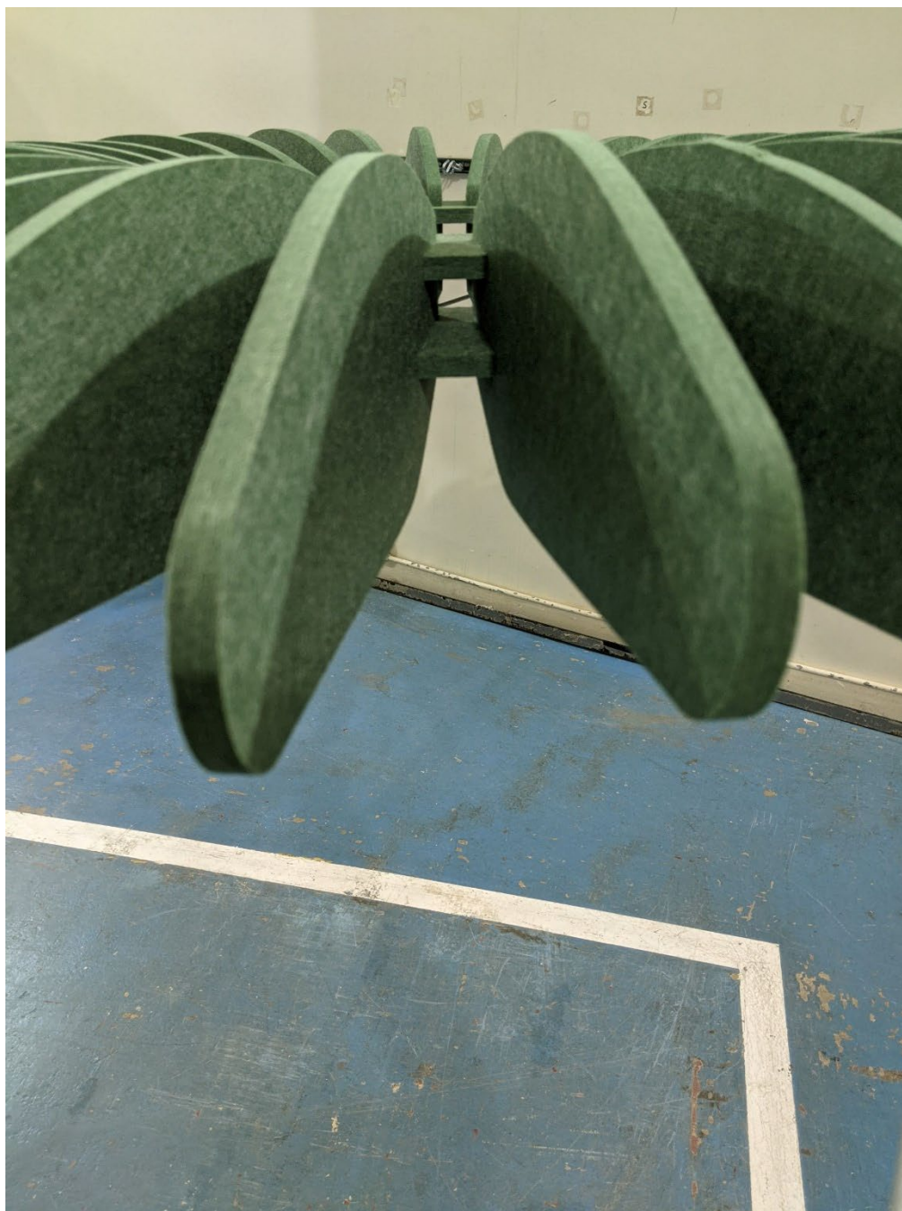
Figure 3 – Detail of specimen material