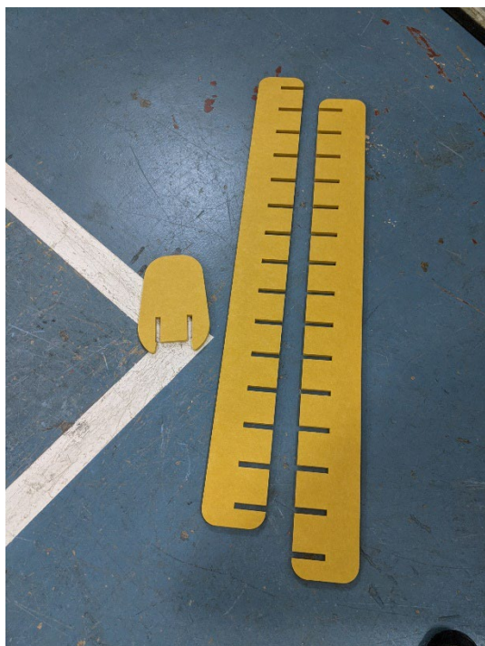
Figure 3 – Specimen fin and pair of channels prior to assembly into baffle