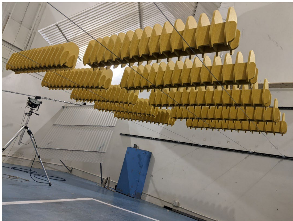
Figure 2 – Specimen mounted in test chamber