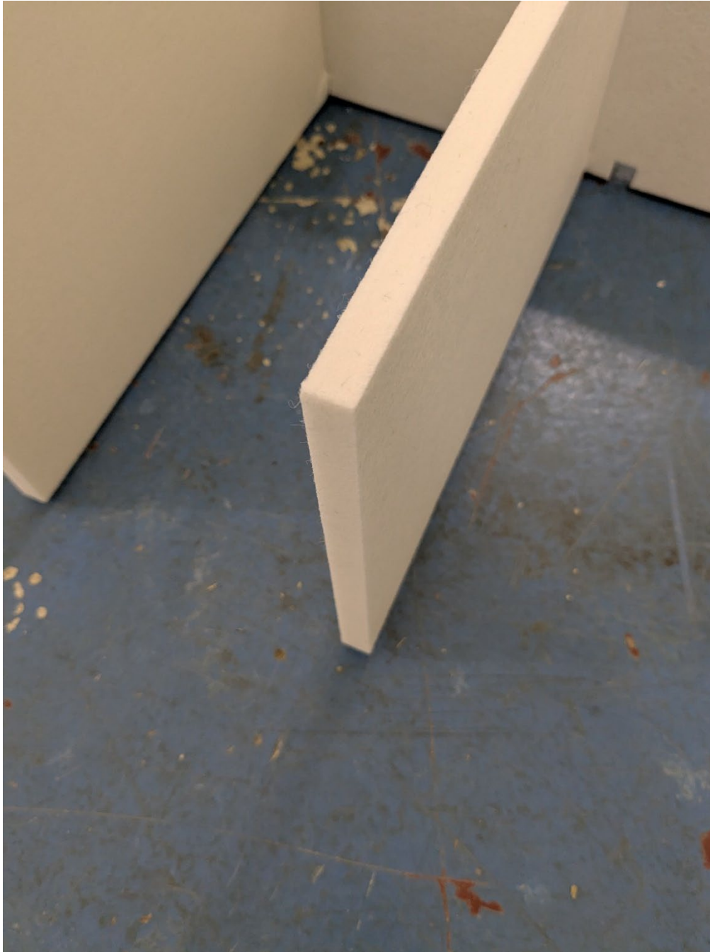
Figure 3 – Detail of specimen material