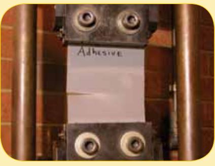
ADHESIVE AFTER: Adhesive after pull test. Adhesive at 2" overlap, metal tears at an average of 13,260 lbs. (joint did not break).