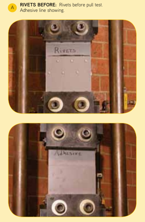
C ADHESIVE BEFORE: Adhesive before pull test.

To find out more about the Saf-T-Liner® C2's strength, you'll have to, well, see it for yourself. Visit www.thomasbus.com to locate your dealer for a test drive.