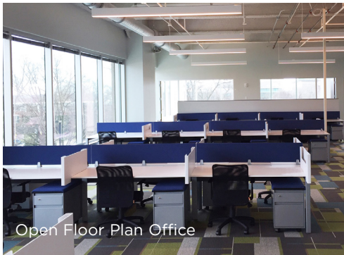
Open Floor Plan Office