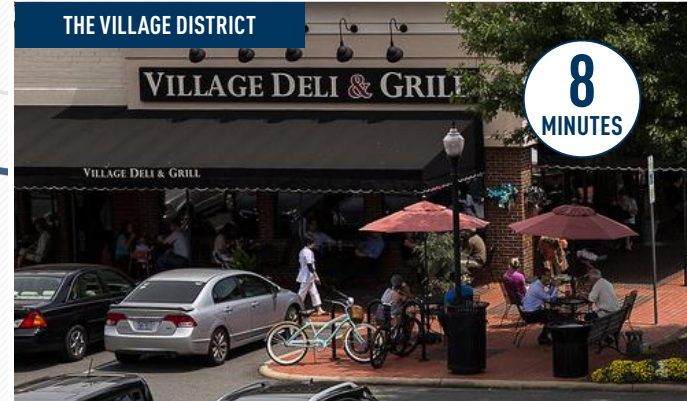
THE VILLAGE DISTRICT