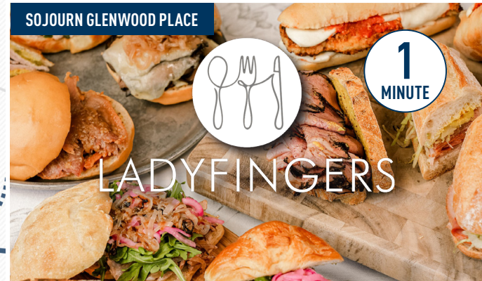
SOJOURN GLENWOOD PLACE