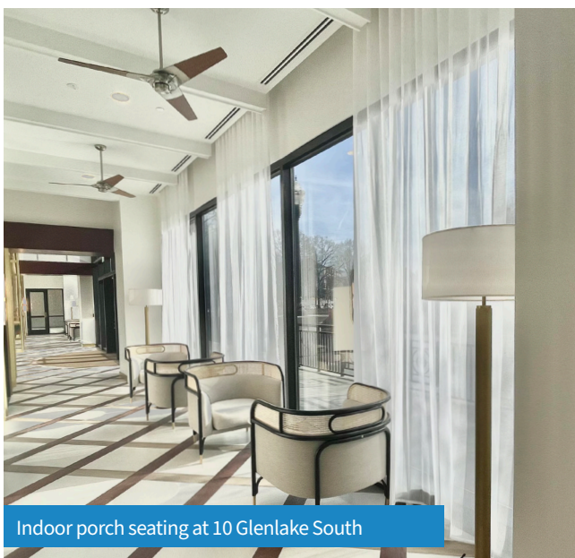
Indoor porch seating at 10 Glenlake South