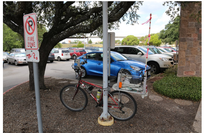
People arrived by all means possible.