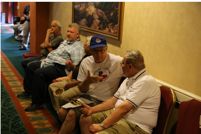
It's not all about equipment, though.