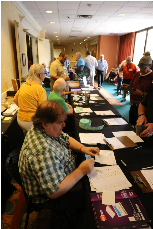
Volunteers helping at registration.