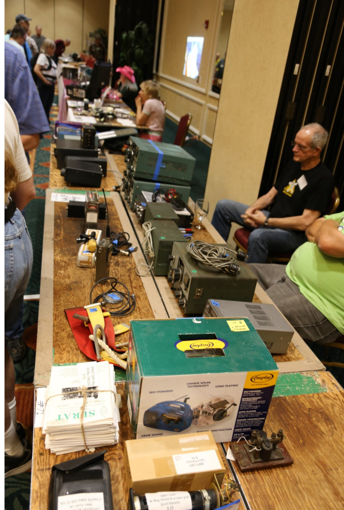
A little of everything for everyone.