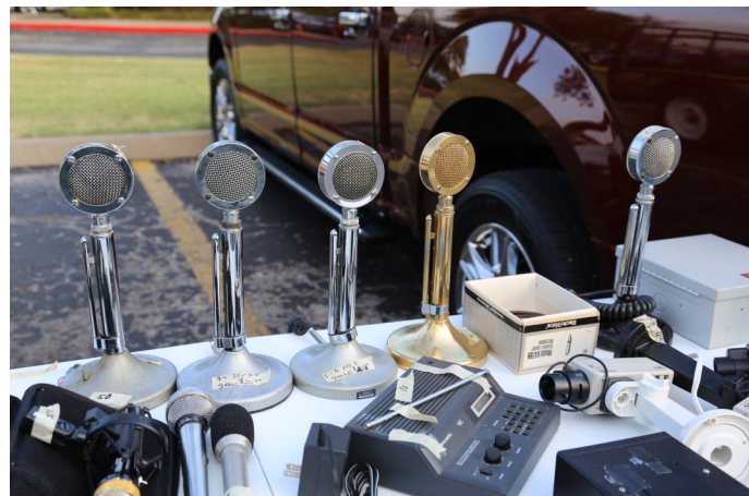
CQ CQ CQ... It this thing turned on?