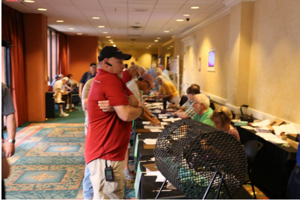
Registration is the first step.