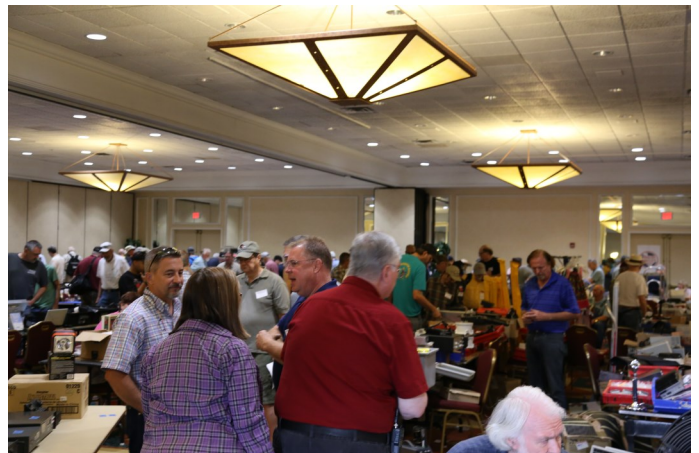
Old friends... New friends.