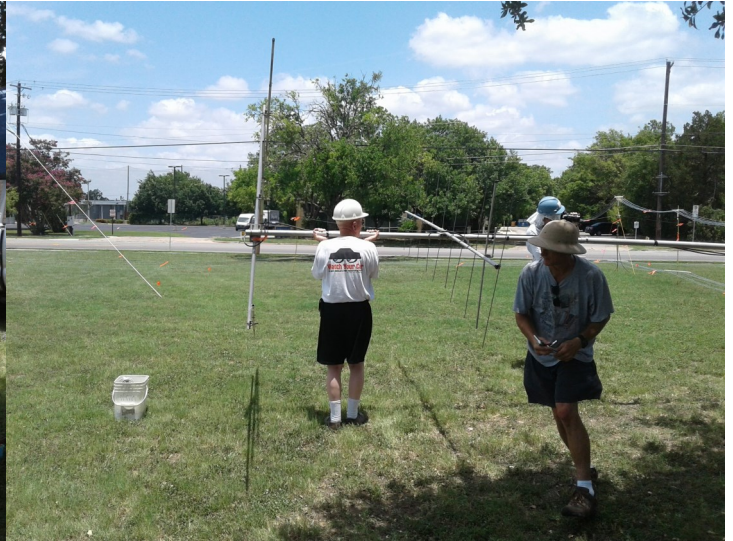
Getting a couple of chin-ups while the bar is low. :-)