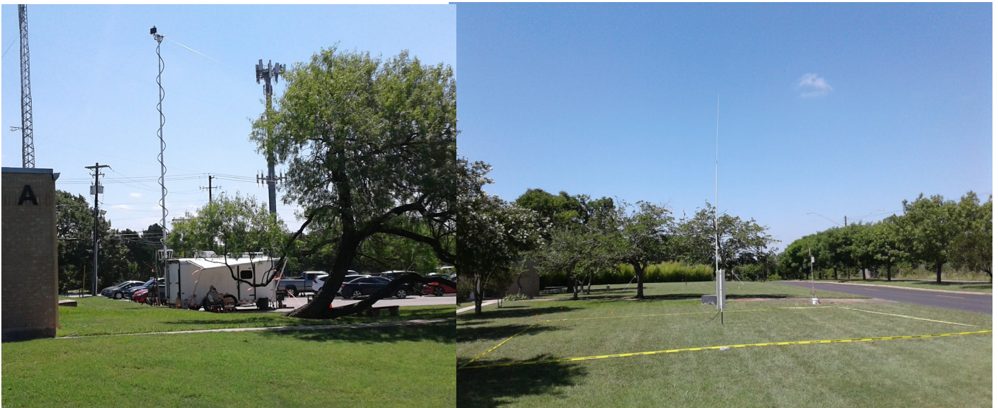
The Travis County ARES EmComm trailer has its mast extended with several antennas deployed.