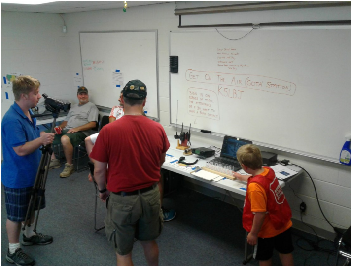
About to flip the switch at the start of the event.