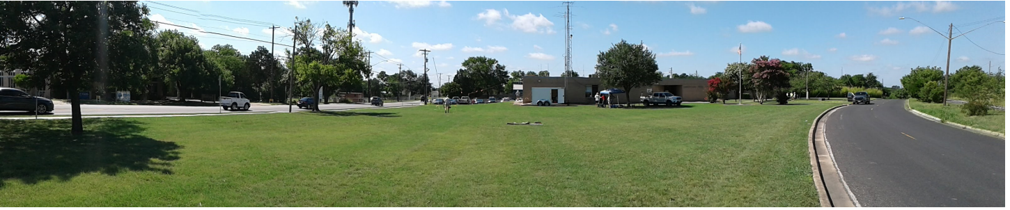
A great panoramic view of the American Red Cross campus.

Here are some more photos of the great time we all had.