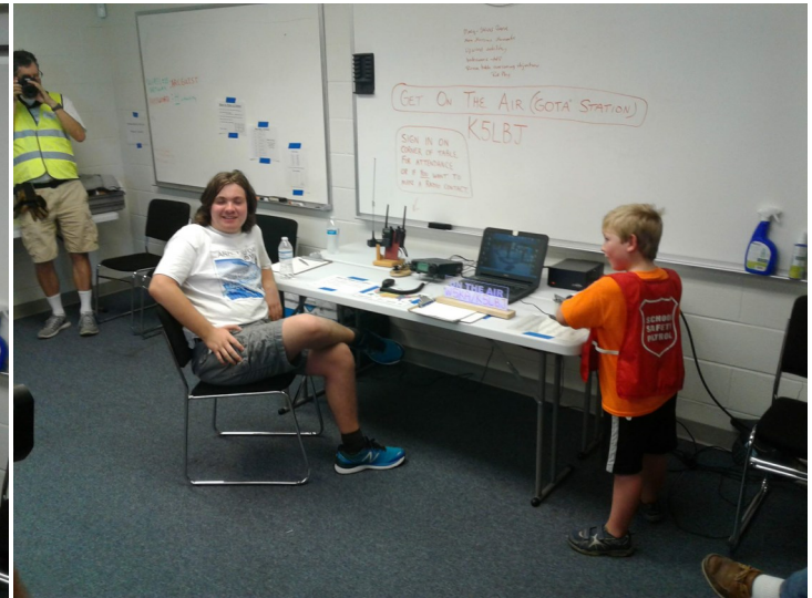
Blue Light Special. No. It's not K-Mart! It's Field Day 2018 - On The Air!