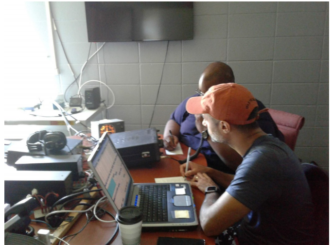
More teamwork... Making contacts.