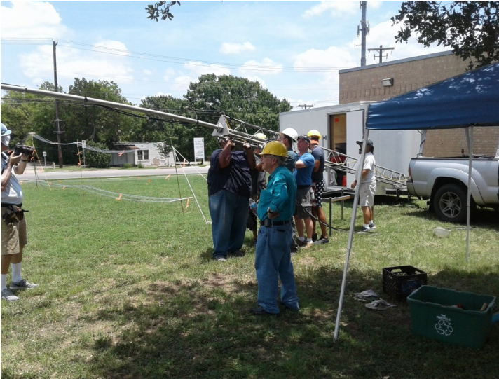
Definitely a team effort.