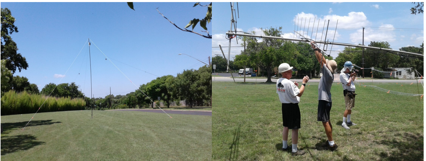
Hard to see in the pic, but bright ribbons mark the antenna wires and guy ropes of this inverted Vee.