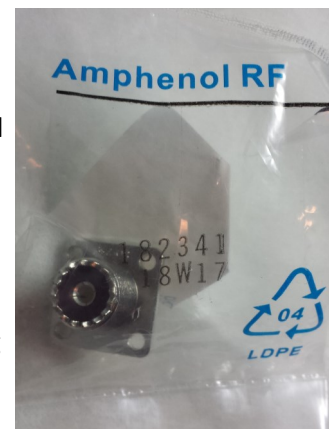
Photo 4 (below) shows another SO-239 that was successfully soldered and was being used in a patch panel. But after a few months it seemed to develop the dreaded "intermittent". The problem was that at times it was being used with "push on" coupling nut male connectors, which relieve one from having to screw connectors together.