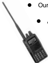
Bonus Prize, Yaesu FT-60R

Furthermore, if you register in advance by mail you have a shot at still one more prize—another Yaesu FT-60R!