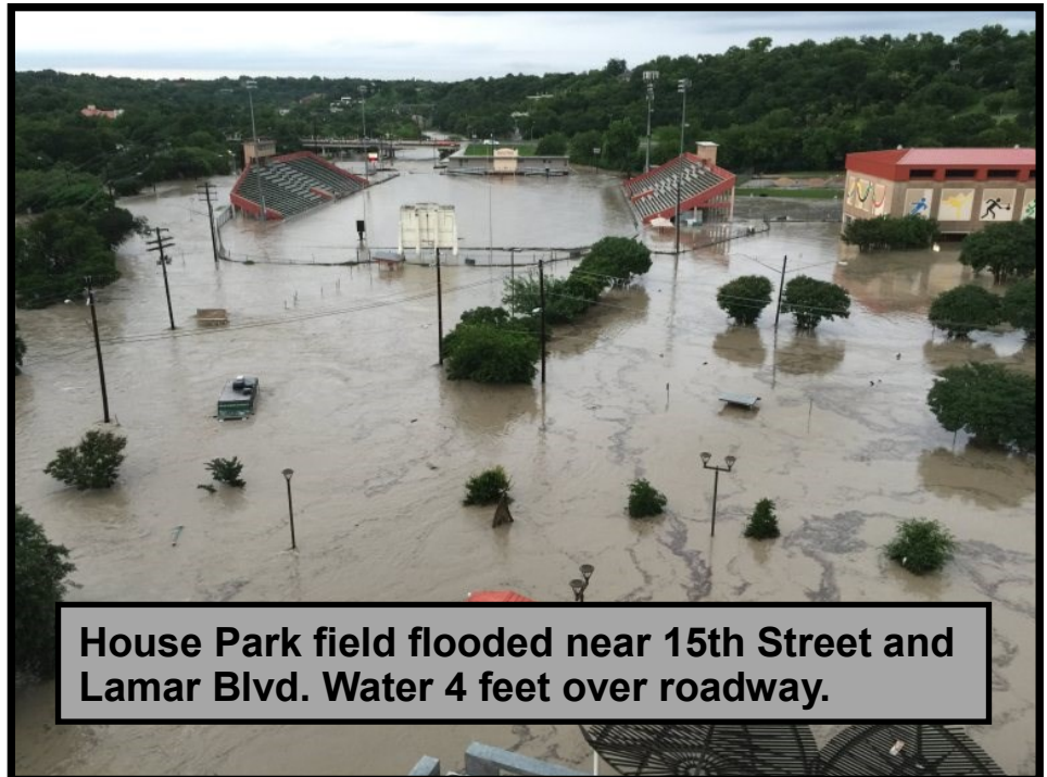
House Park field flooded near 15th Street and Lamar Blvd. Water 4 feet over roadway.

However, before all this rain accumulated, Amateur Radio operators were already out and about with an active weathernet. Local