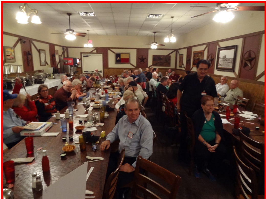
Guests at the party awaiting the door prize drawing.