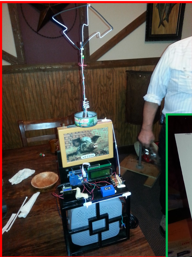
WESHOG Prize has the final touch of luminescent wire along the mast and lights up when keyed.