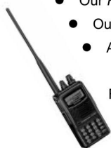
Bonus Prize, Yaesu FT-60R

Furthermore, if you register in advance by mail you have a shot at still one more prize—another Yaesu FT-60R!