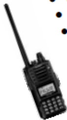
Advance Registration and Bonus Prize, Yaesu FT-270R

Furthermore, if you register in advance by mail you have a shot at still one more prize—another Yaesu FT-270R!