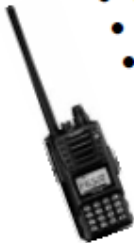
Advance Registration and Bonus Prize, Yaesu FT-270R

Furthermore, if you register in advance by mail you have a shot at still one more prize—another Yaesu FT-270R!