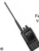
Featured Prize, Yaesu FT-60R

With your registration you get one ticket good for Saturday's door prizes and the Major Prizes, and you can buy more tickets at $1 each. Plus, if you rent a room at one of the Convention Hotels, you'll get five bonus tickets for each room-night, up to a total of ten tickets. (See next page for prize rules.)