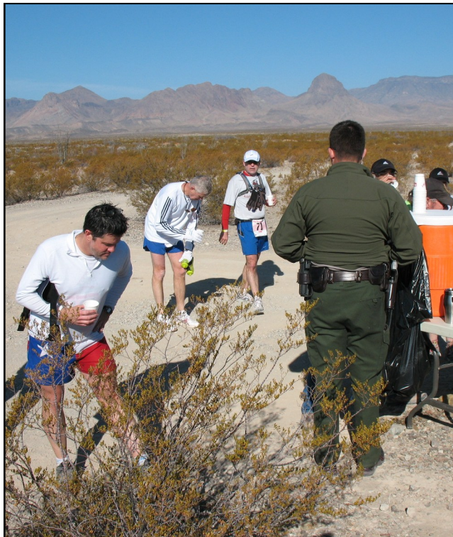
Runners stop for a little refreshment while park ranger stands by to give medical help if needed.

Happily, no runners were lost during the race even though one overslept and started 45 minutes later than everyone else. A great time was had by all and the race proceeds benefitted Friends of Big Bend National Park.