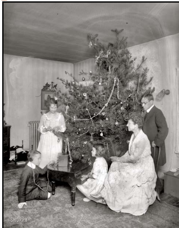
Christmas 1921. Notice the little boy with his radio and keyer!

For more information about early radio, visit... http://www.wpr.org/hd/hd_innovation.cfm