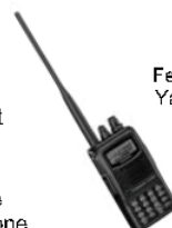
Featured Prize, Yaesu FT-60R