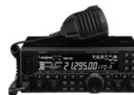
Grand Prize, Yaesu FT-450AT