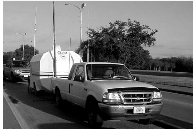
The mobile headquarters, known as NCS