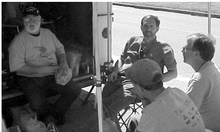
“Ahhh lunchtime, after a job well done!”