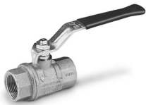
Figure 161N-LF (Threaded Ends)