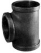
Tee Fig. 1105