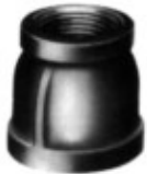
Reducer Fig. 1125