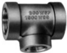
XH Tee, Reducing Fig. 1164R