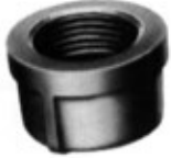
Cap Fig. 1124