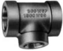
XH Tee Fig. 1164