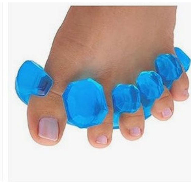
A: FenF's GEMS® Product

10. The GEMS® product sold by FenF includes upstanding posts made of an elastic material. Each of the upstanding posts has a faceted gemstone handle at a free end thereof. A representative photograph of the GEMS® product is shown below in photograph A.