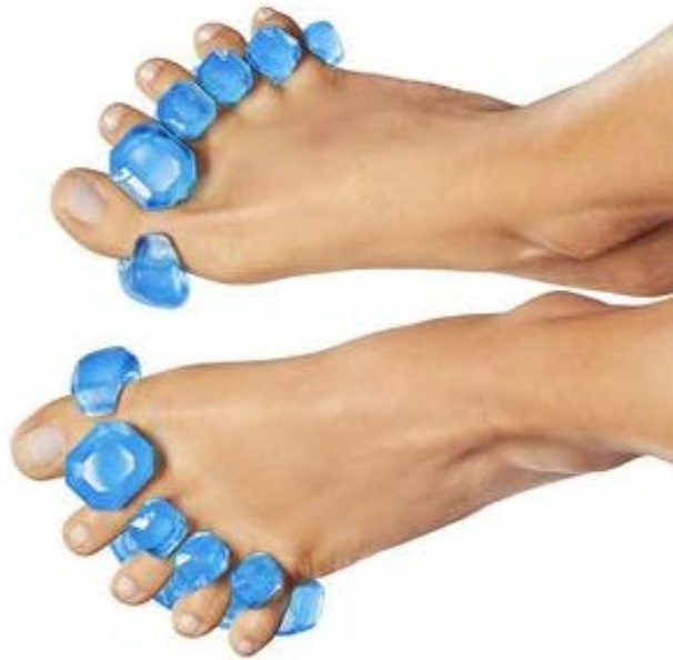
B: Copyright of GEMS® Product

16. On information and belief, Groupon owns and operates an interactive website, www.groupon.com , that advertises and offers certain products for sale to the general public within the United States, including in this District.