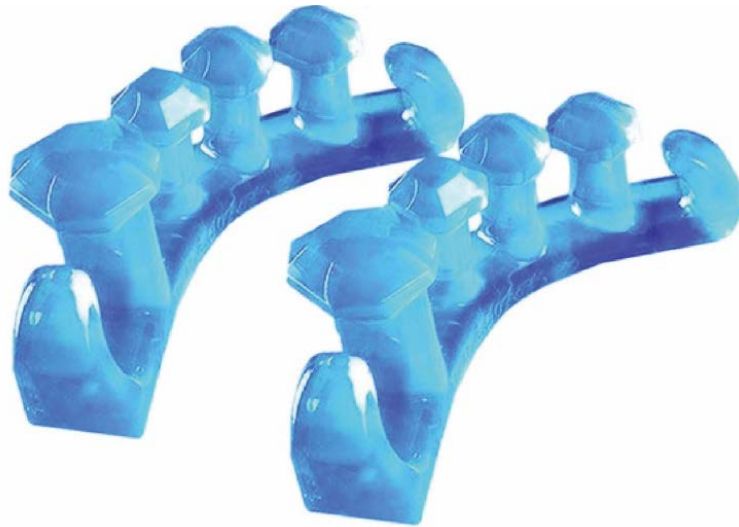
D: Image of Groupon Product