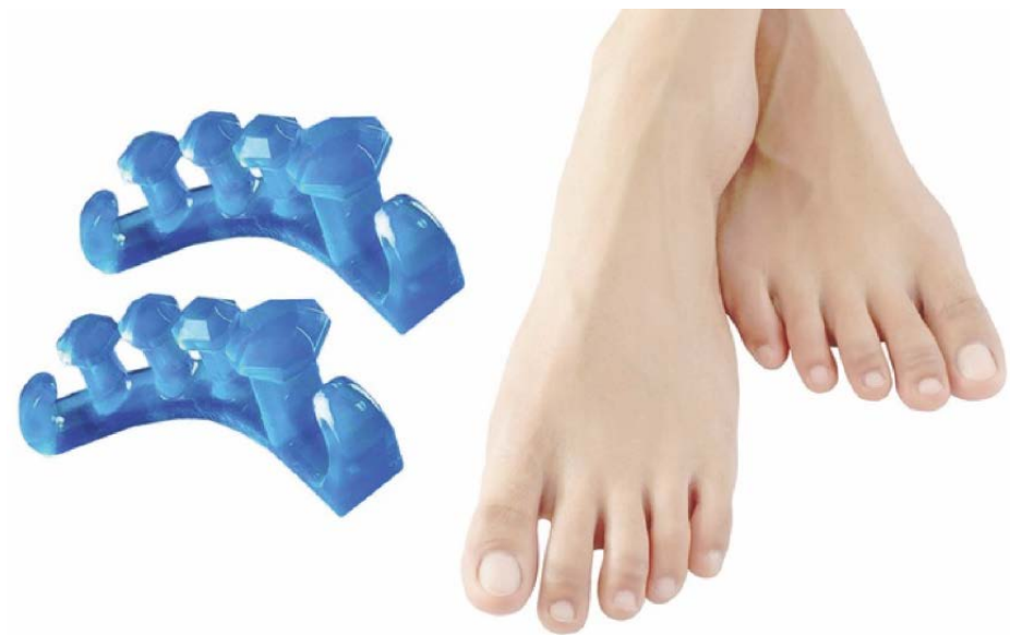
E: Image of Groupon Product (left) With Feet

20. On the relevant webpage in which the Groupon Product is advertised and offered for sale, Groupon displays an image of the Groupon product along with an unauthorized reproduction of FenF's copyrighted work that is the subject of the