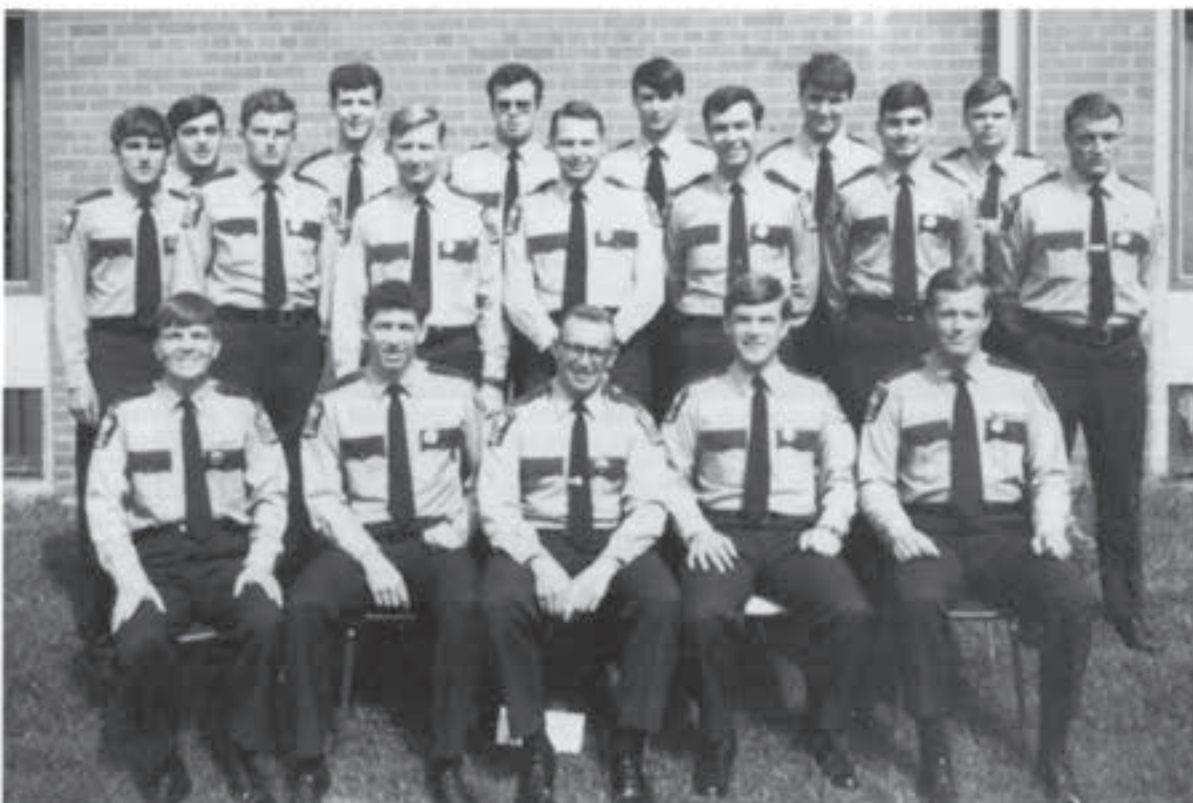
The 1972 recruit class