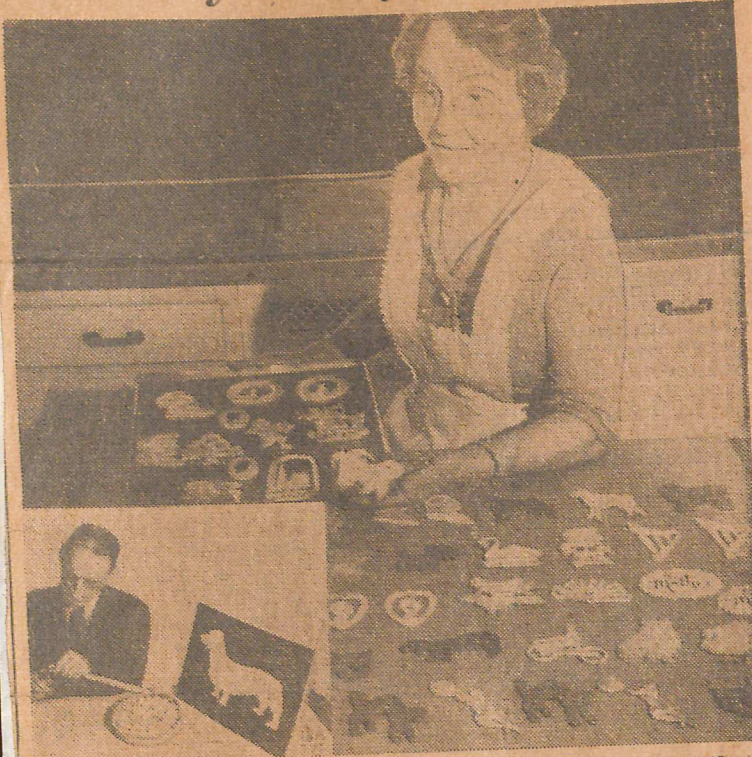
These artists combine their talents to turn out perfect profile likenesses for the cooky box