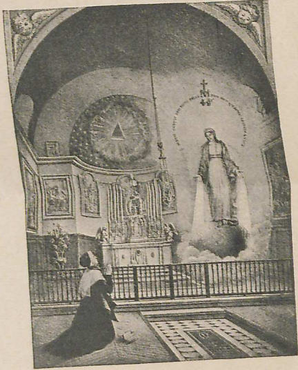
THIRD APPEARITION—MANIFESTATION OF THE MIRACULOUS MEDAL TO SISTER CATHERINE. (See page 6.)

Volumes have been filled with letters telling of the power of Mary Immaculate, yet thousands of stories are still untold. Many favors that would give honor to her name are not